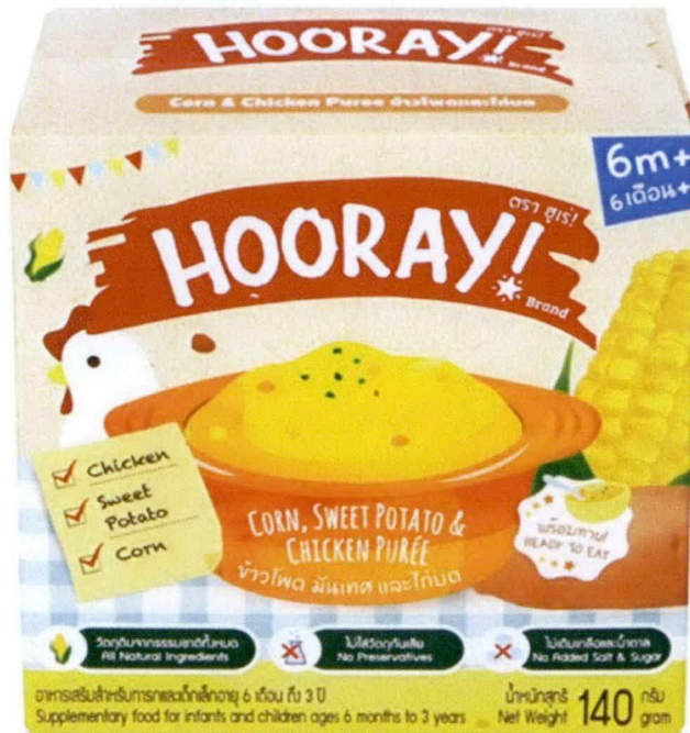
Figure 1. Unregistered Corn, Sweet Potato & Chicken Puree (6m +)

The Food and Drug Administration (FDA) warns the public from purchasing and consuming the following unregistered food products: