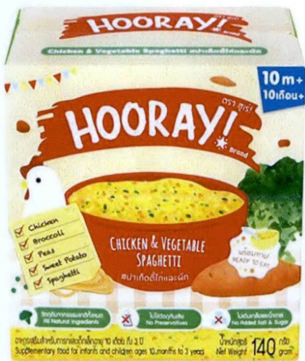
Figure 2. Unregistered HOORAY! Chicken & Vegetable Spaghetti (10m+)