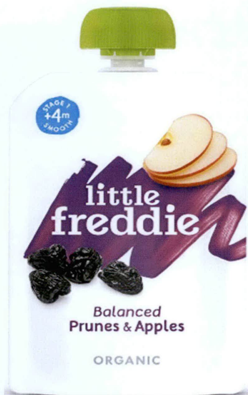
Figure 4. Unregistered LITTLE FREDDIE Balanced Prunes & Apples