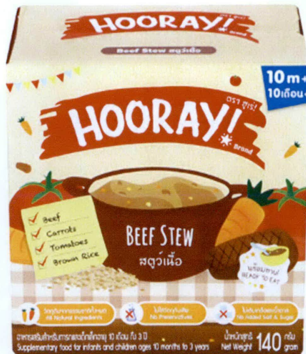
Figure 3. HOORAY! Beef Stew(10m+)