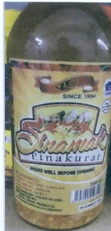
Figure 3. Unregistered 4C Sinamak Pinakurat