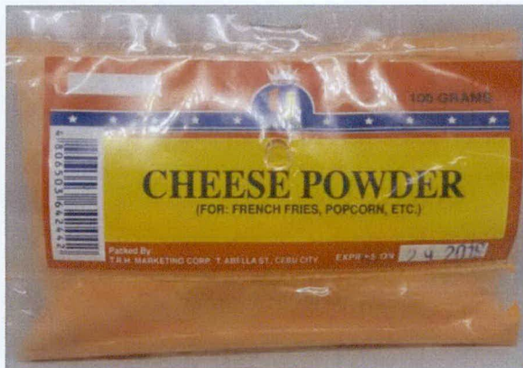
Figure 4. Unregistered TJ BRAND Cheese Powder