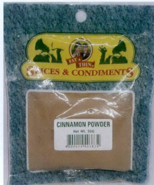
Figure 5. Unregistered FAT & THIN® Spices & Condiments Cinnamon Powder

The FDA verified through post-marketing surveillance that the abovementioned food products are not registered and the Certificate of Product Registration (CPR) have not yet been issued. Pursuant to the Republic Act No. 9711, otherwise known as the “Food and Drug Administration Act of 2009”, the manufacture, importation, exportation, sale, offering for