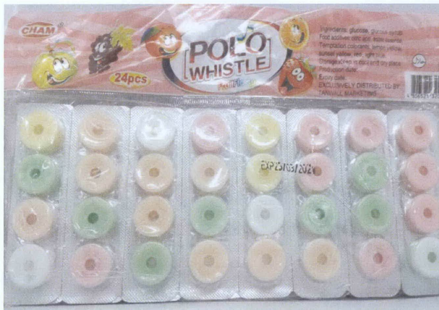
Figure 1. Unregistered CHAM® POLO Whistle Fruit Flavor

The Food and Drug Administration (FDA) warns the public from purchasing and consumption of the following unregistered food products: