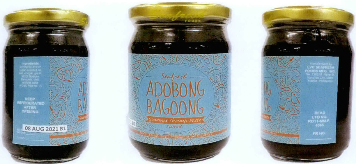
Figure 2. Unregistered SEAFRESH Adobong Bagoong Gourmet Shrimp Paste Sweet