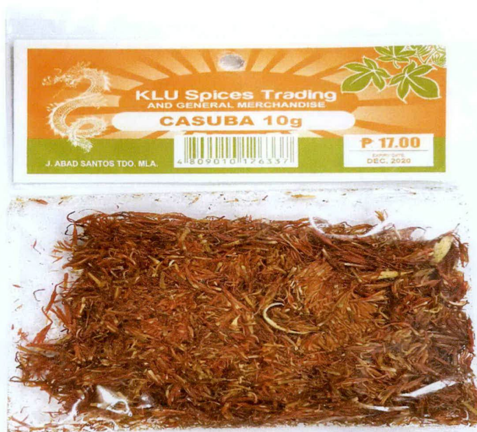
Figure 5. Unregistered CASUBA by KLU Spices Trading and General Merchandise

The FDA verified through post-marketing surveillance that the abovementioned food products are not authorized and the Certificates of Product Registration (CPR) have not been issued. Pursuant to the Republic Act No. 9711, otherwise known as the “Food and Drug Administration Act of 2009”, the manufacture, importation, exportation, sale, offering for sale, distribution, transfer, non-consumer use, promotion, advertising or sponsorship of health products without the proper authorization is prohibited.