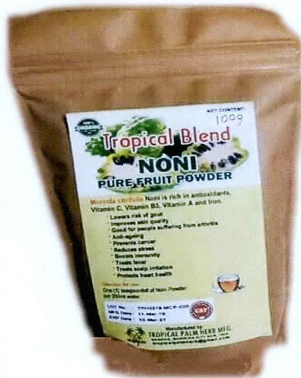
Figure 3. Unregistered TROPICAL BLEND NONI Pure Fruit Powder