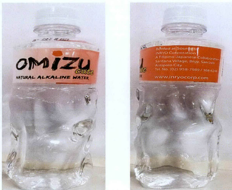
Figure 1. Unregistered OMIZU Cute Natural Alkaline Water

The Food and Drug Administration (FDA) advises the public from purchasing and consumption of the following unregistered food products: