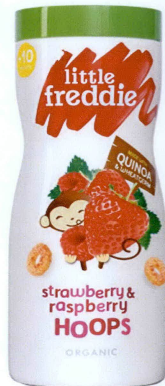
Figure 5. Unregistered LITTLE FREDDIE Strawberry & Raspberry Hoops