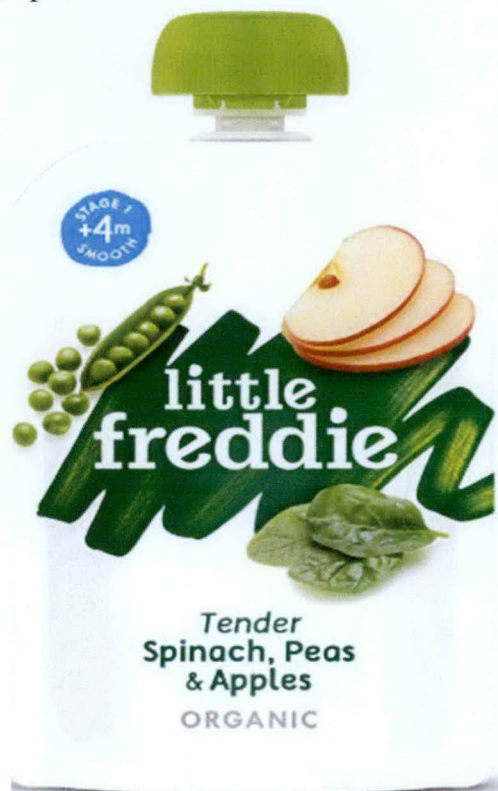
Figure 1. Unregistered LITTLE FREDDIE, Tender Spinach, Peas & Apples

The Food and Drug Administration (FDA) warns the public from purchasing and consuming the following unregistered food products: