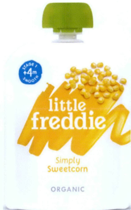
Figure 3. LITTLE FREDDIE, Simply Sweetcorn