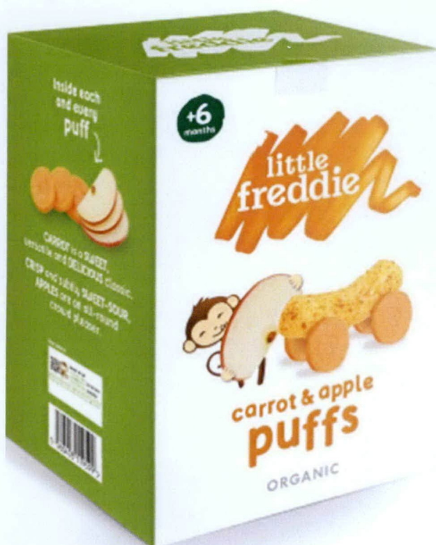
Figure 4. Unregistered LITTLE FREDDIE Carrot and Apple Puffs