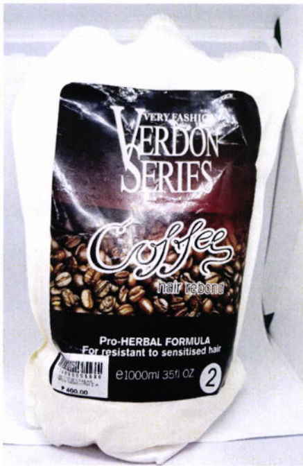
Figure 2. Unnotified Very Fashion Verdon Series Coffee Hair Rebond Pro-Herbal Formula (2)