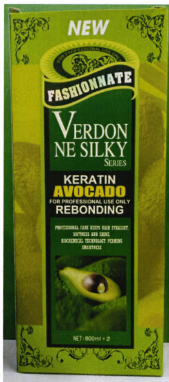
Figure 4. Unnotified Fashionnate Verdon Ne Silky Series Keratin Avocado Rebonding For Professional Use On