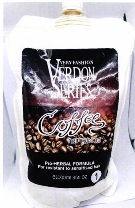
Figure 1. Unnotified Very Fashion Verdon Series Coffee Hair Rebond Pro-Herbal Formula (1)

The Food and Drug Administration (FDA) warns the public from purchasing and using the following unnotified cosmetic products: