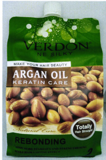
Figure 3. Unnotified Verdon® Ne Silky Argan Oil Keratin Care Rebonding (2)