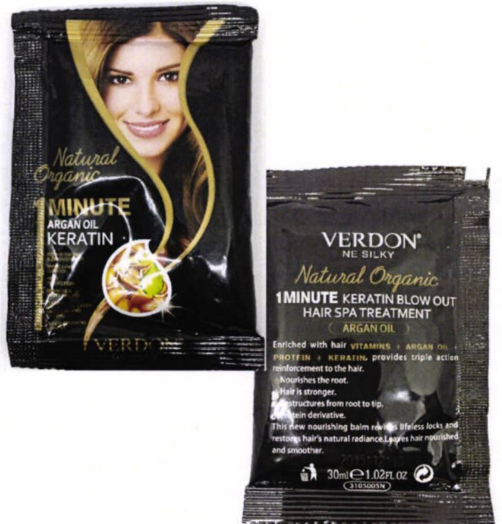
Figure 5. Unnotified Verdon® Ne Silky Natural Organic 1Minute Keratin Blow Out Hair Spa Treatment