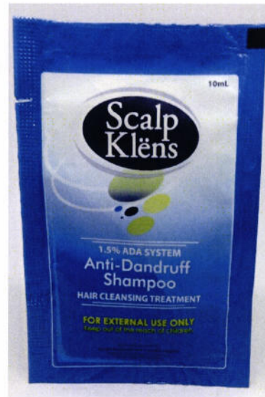
Figure 3. Unnotified Scalpklens Anti-Dandruff Shampoo Hair Cleansing Treatment