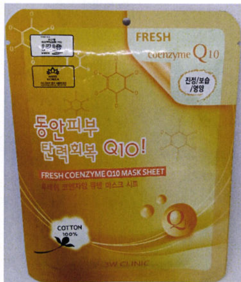
Figure 5. Unnotified 3W Clinic Fresh Coenzyme Q10