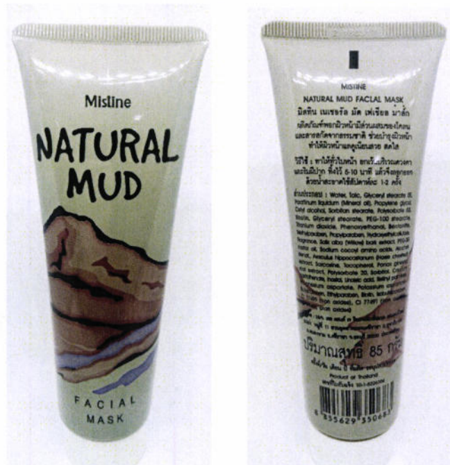
Figure 1. Unnotified Misline Natural Mud Facial Mask

The Food and Drug Administration (FDA) warns the public from purchasing and using the following unnotified cosmetic products: