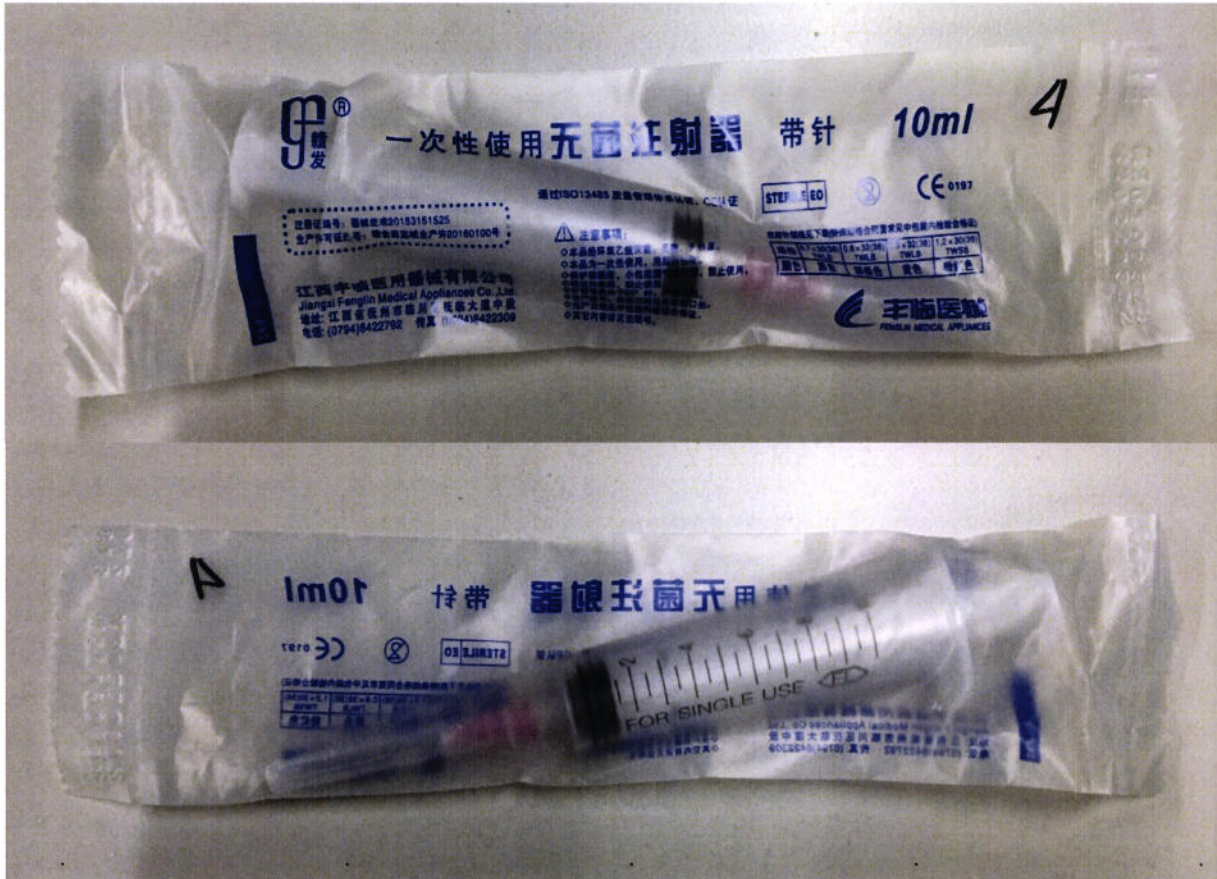
Figure 4. Unregistered Syringe 10ml with needle

The FDA verified through post-marketing surveillance that the abovementioned medical devices are not registered and the Certificates of Product Registration (CPR) have not yet been issued. Pursuant to the Republic Act No. 9711, otherwise known as the “Food and Drug Administration Act of 2009”, the manufacture, importation, exportation, sale, offering for sale, distribution, transfer, non-consumer use, promotion, advertising or sponsorship of health products without the proper authorization is prohibited.