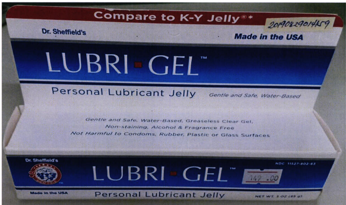
Figure 1. Unregistered Dr. Sheffield's Lubri-gel Personal Lubricant Jelly

The Food and Drug Administration (FDA) warns the general public against the purchase and use of the unregistered medical device: