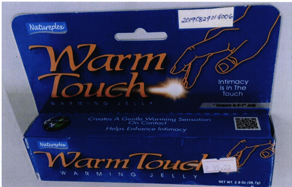
Figure 1. Unregistered Natureplex Warm Touch Warming Jelly

The Food and Drug Administration (FDA) warns the general public against the purchase and use of the unregistered medical device: