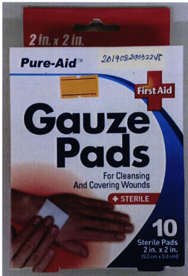
Figure 1. Front label of unregistered "Pure-Aid Gauze Pads"

The Food and Drug Administration (FDA) warns the general public against the purchase and use of the unregistered medical device: