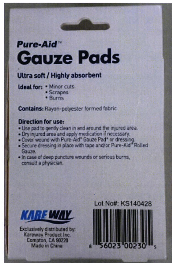
Figure 2. Back label of unregistered "Pure-Aid Gauze Pads"