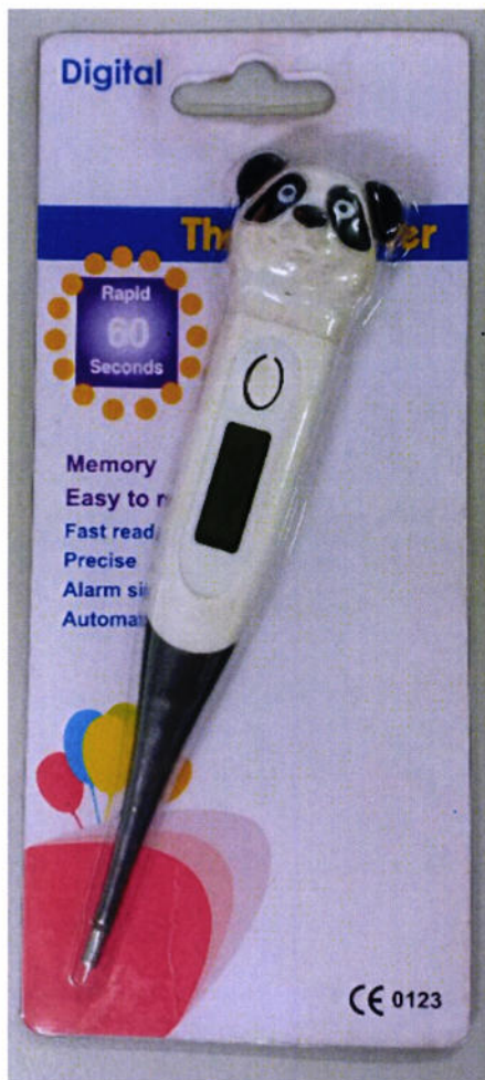
Figure 1. Front label of the unregistered “Digital Thermometer”

The Food and Drug Administration (FDA) warns the general public against the purchase and use of the unregistered medical device: