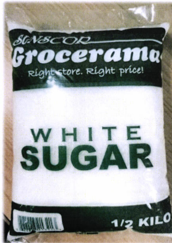
Figure 1. Unregistered SUNSCOR Grocerama White Sugar

The Food and Drug Administration (FDA) advises the public from purchasing and consuming the following unregistered food products: