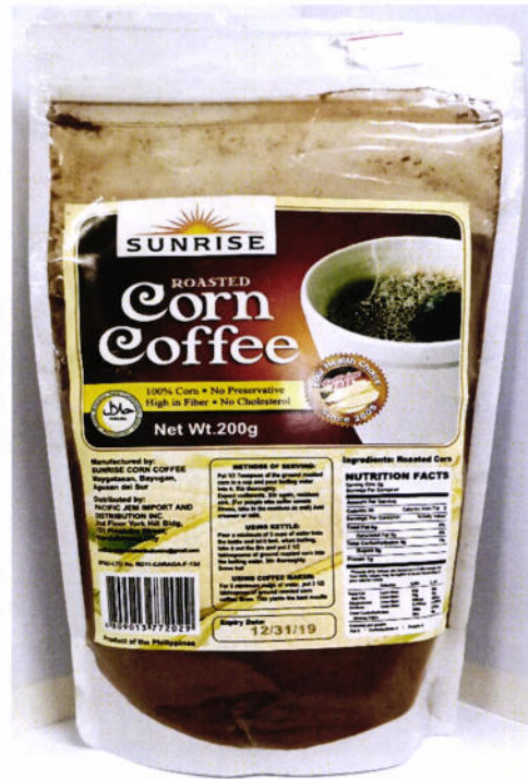
Figure 2. Unregistered SUNRISE Roasted Corn Coffee