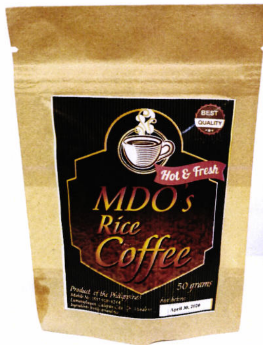
Figure 4. Unregistered MDO'S Rice Coffee

The FDA verified through post-marketing surveillance that the abovementioned food products are not authorized and the Certificates of Product Registration (CPR) have not been issued. Pursuant to the Republic Act No. 9711, otherwise known as the “Food and Drug Administration Act of 2009”, the manufacture, importation, exportation, sale, offering for sale, distribution, transfer, non-consumer use, promotion, advertising or sponsorship of health products without the proper authorization is prohibited.