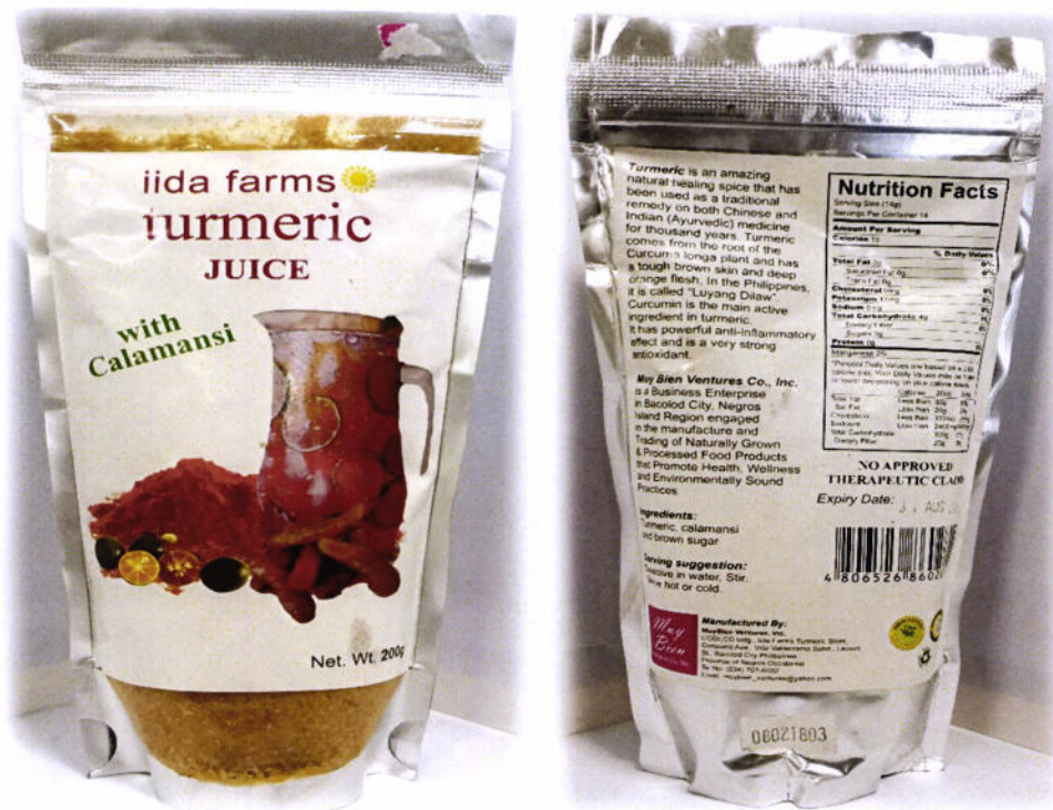
Figure 3. Unregistered IIDA FARMS Turmeric Juice with Calamansi