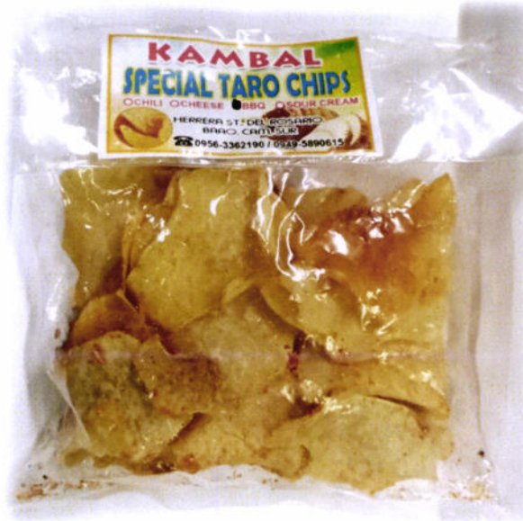
Figure 4. Unregistered KAMBAL Special Taro Chips – Barbecue Flavor