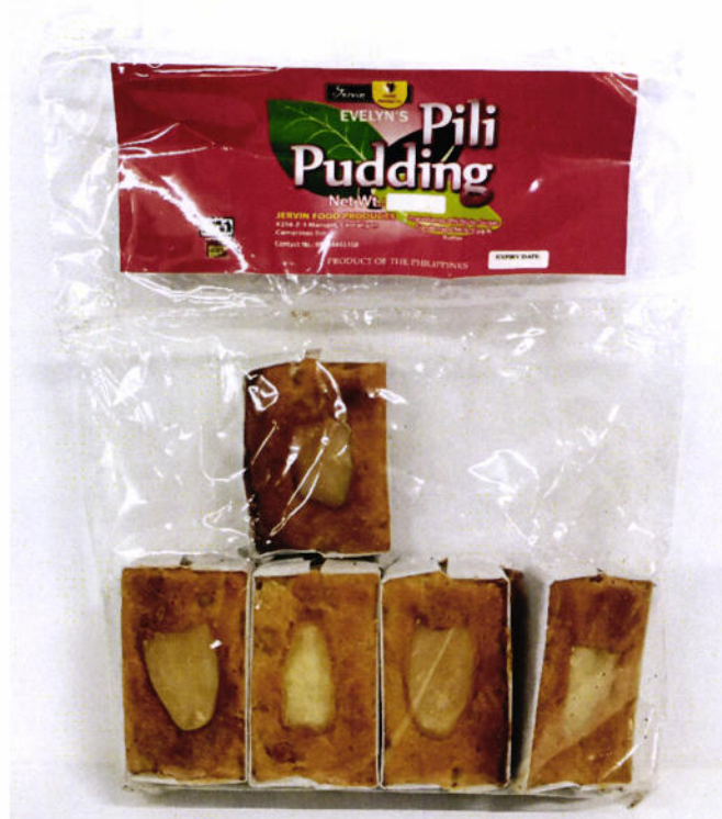
Figure 3. Unregistered JERVIN FOOD PRODUCTS EVELYN'S Pili Pudding