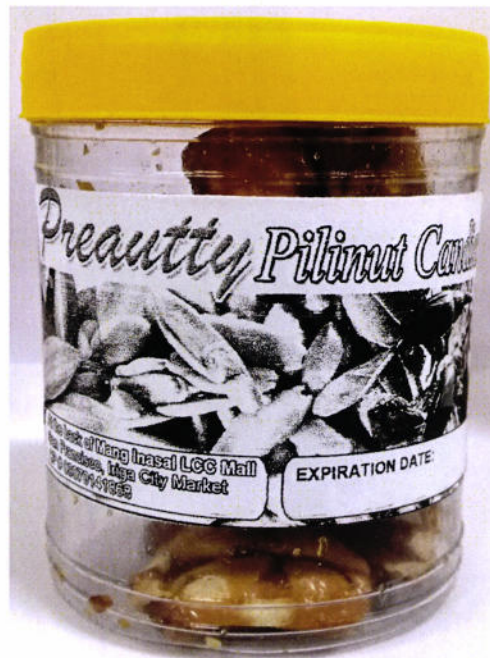
Figure 1. Unregistered PREAUTTY Pilinut Candies

The Food and Drug Administration (FDA) advises the public from purchasing and consuming the following unregistered food products: