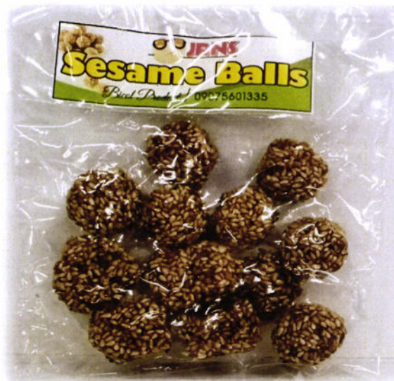
Figure 5. Unregistered JRNS Sesame Balls

The FDA verified through post-marketing surveillance that the abovementioned food products are not authorized and the Certificates of Product Registration (CPR) have not been issued. Pursuant to the Republic Act No. 9711, otherwise known as the “Food and Drug Administration Act of 2009”, the manufacture, importation, exportation, sale, offering for sale, distribution, transfer, non-consumer use, promotion, advertising or sponsorship of health products without the proper authorization is prohibited.