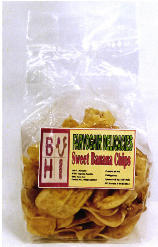
Figure 2. Unregistered BUHI FARVOGAIR Sweet Banana Chips