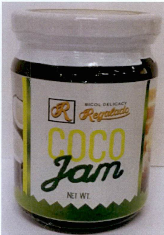
Figure 4. Unregistered REGALADO Coco Jam