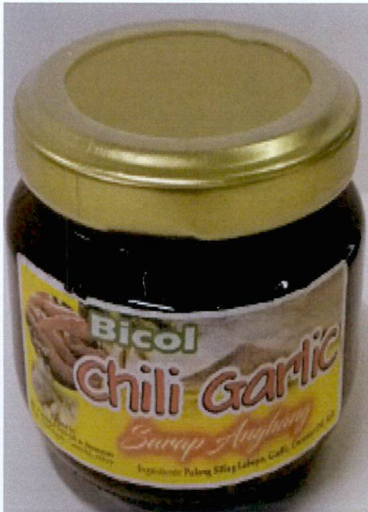
Figure 2. Unregistered BICOL Chili Garlic