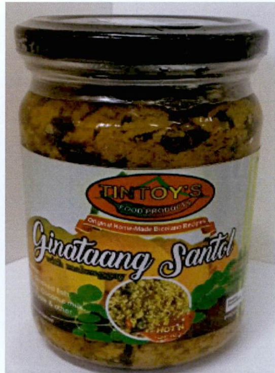
Figure 3. Unregistered TINTOY'S FOOD PRODUCTS Ginataang Santol with Malungay Hot 'N Spicy