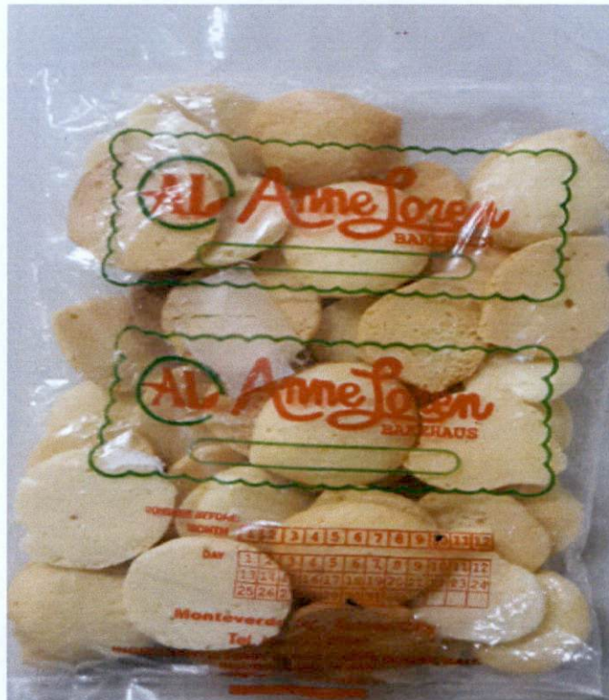
Figure 1. Unregistered AL Anne Loren Drop Cookies

The Food and Drug Administration (FDA) warns the public from purchasing and consuming of the following unregistered food products: