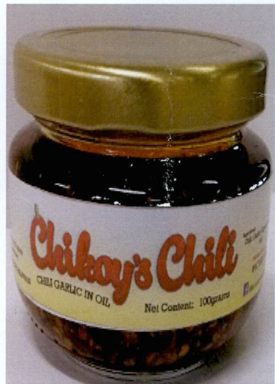
Figure 5. Unregistered CHIKOY'S CHILI Chili Garlic in Oil