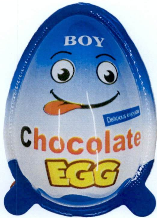
Figure 2. Unregistered BOY Chocolate Egg