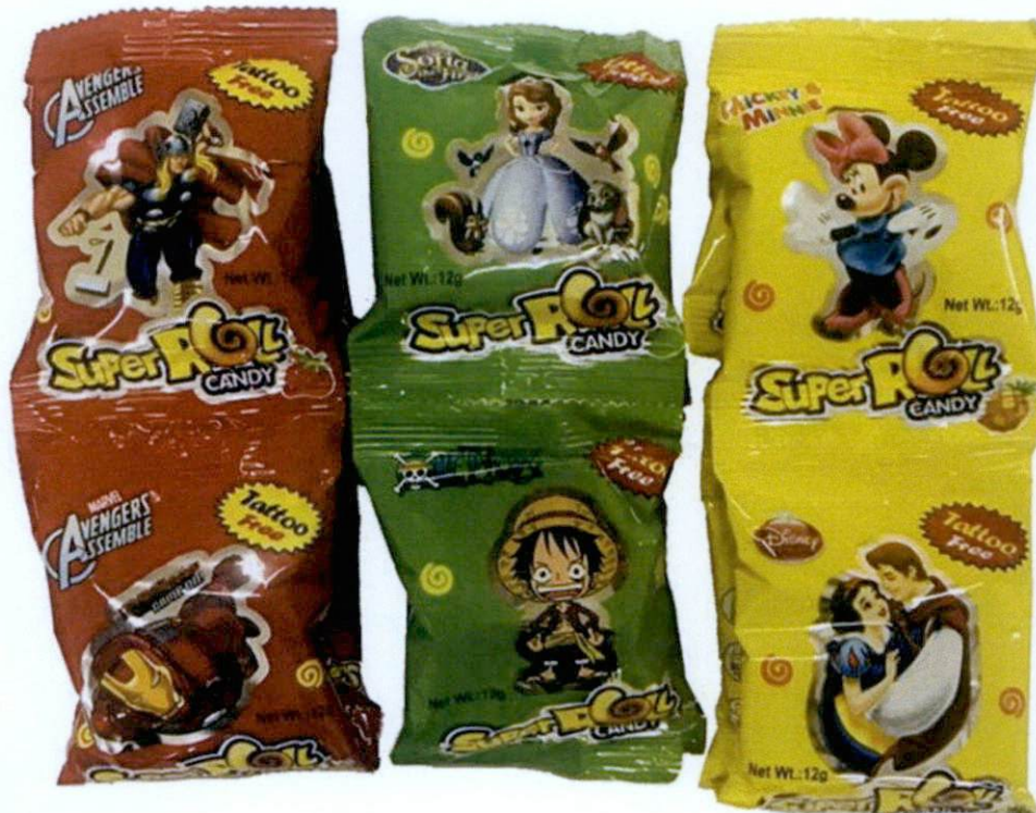
Figure 1. Unregistered SUPER ROLL Candy (Assorted)

The Food and Drug Administration (FDA) warns the public from purchasing and consuming the following unregistered food products: