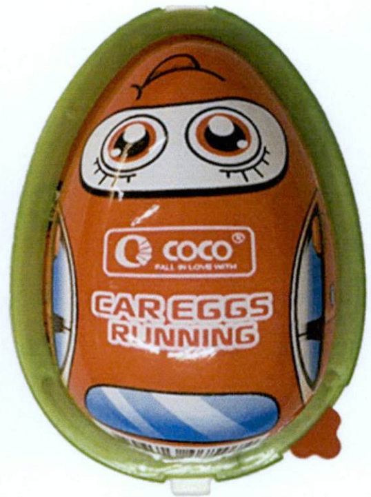
Figure 3. Unregistered COCO FALL INLOVE WITH Car Eggs Running