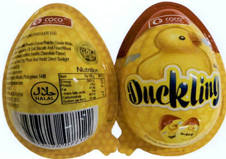
Figure 4. Unregistered COCO FALL INLOVE WITH Duckling Cocoa Butter Chocolate