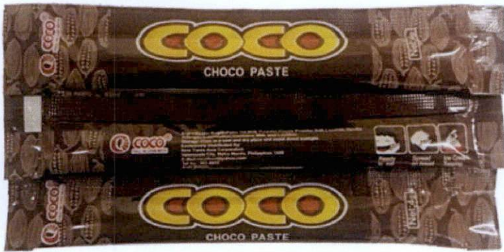
Figure 4. Unregistered COCO Choco Paste