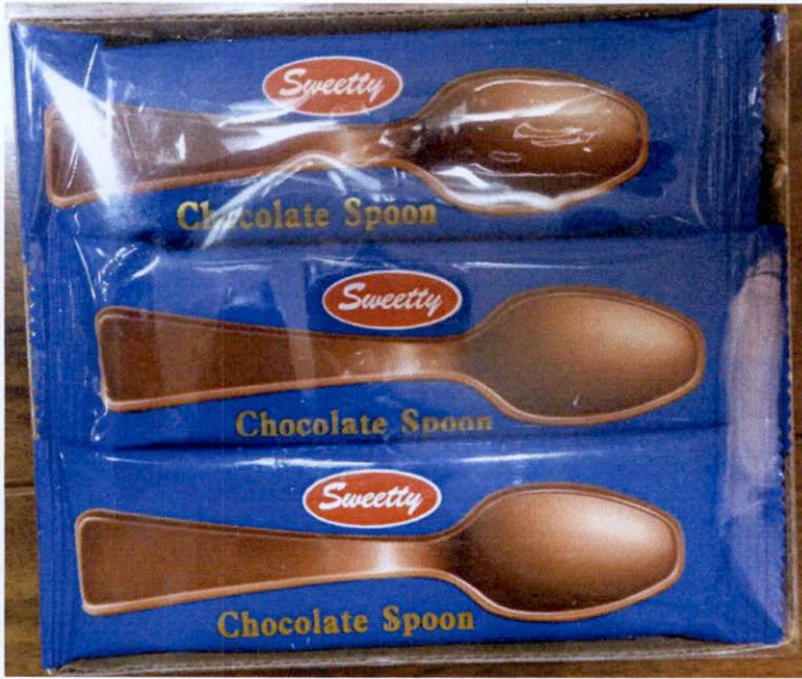
Figure 2. Unregistered SWEETTY Chocolate Spoon