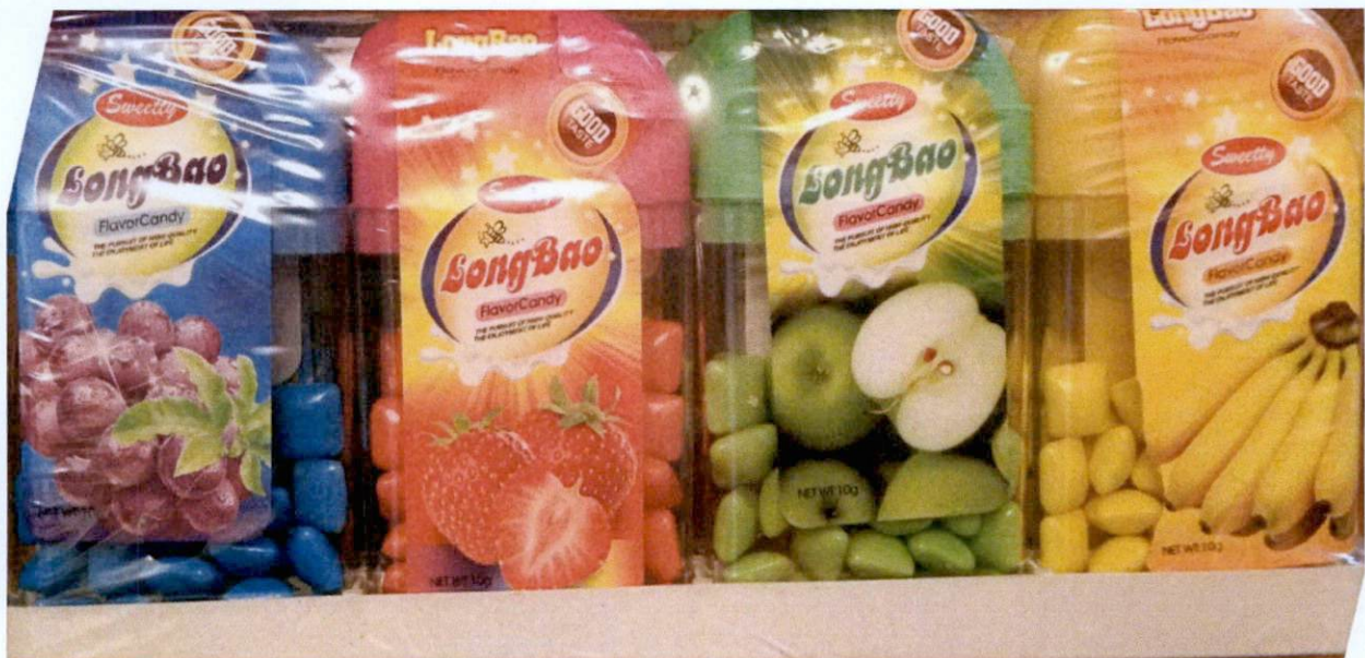
Figure 1. Unregistered SWEETTY Long Bao Flavor Candy (Assorted)

The Food and Drug Administration (FDA) warns the public from purchasing and consuming the following unregistered food products: