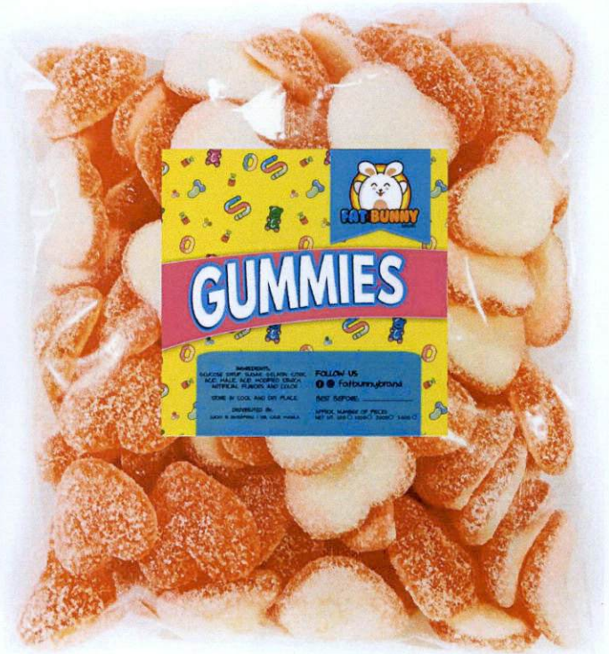
Figure 3. Unregistered FAT BUNNY Gummies