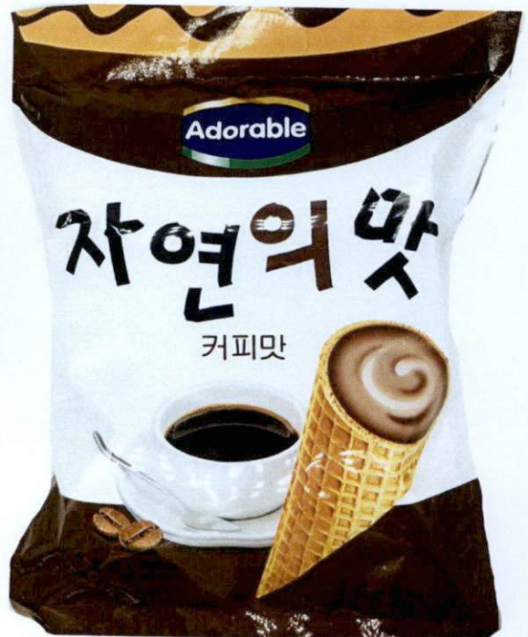
Figure 5. Unregistered ADORABLE Creambar, Chocolate Flavor