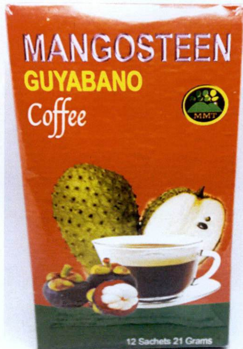
Figure 5. Unregistered MORINGA MOUNTAIN Mangosteen Guyabano Coffee