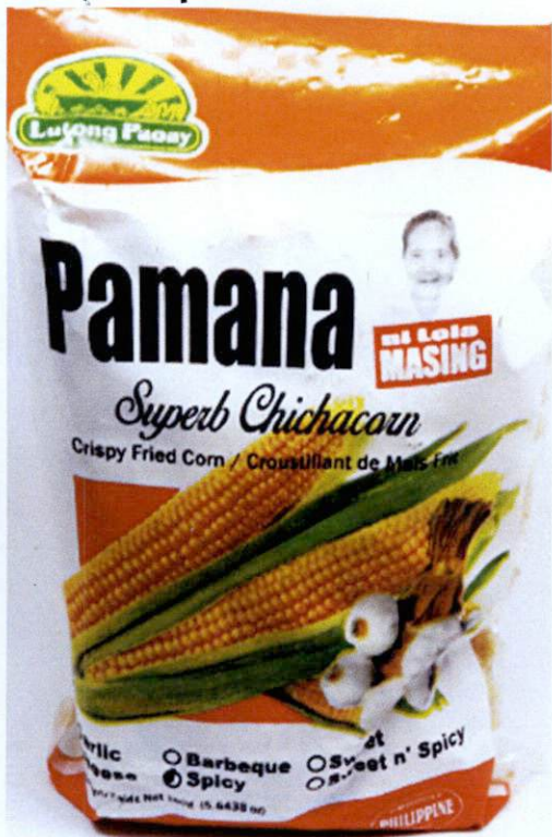
Figure 2. Unregistered PAMANA NI LOLA MASING Superb Chichacorn Crispy Fired Corn