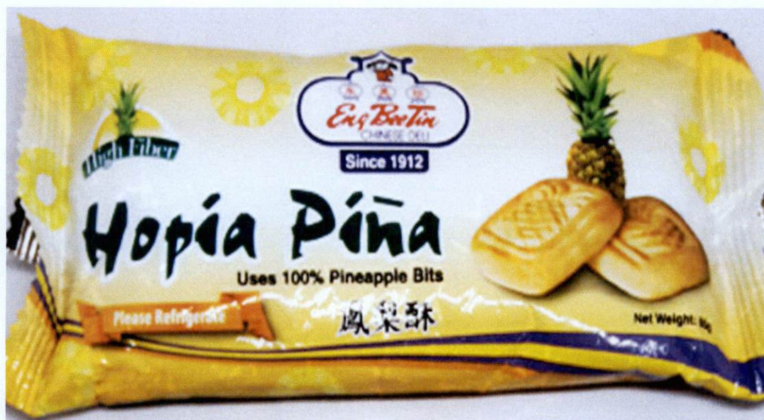
Figure 1. Unregistered ENG BEE TIN Hopia Piña

The Food and Drug Administration (FDA) warns the public from purchasing and consuming the following unregistered food products: