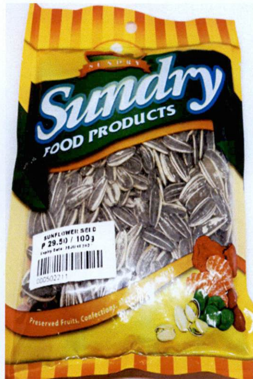
Figure 3. Unregistered SUNDRY FOOD PRODUCTS Sunflower Seed