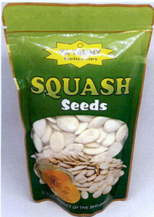
Figure 4. Unregistered YA YAMMY DELICACIES Squash Seeds