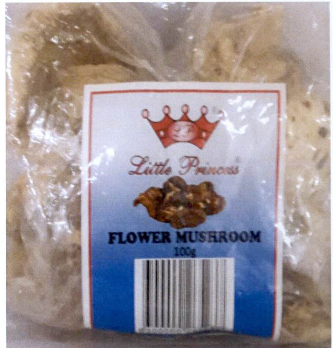
Figure 3. Unregistered LITTLE PRINCESS Flower Mushroom