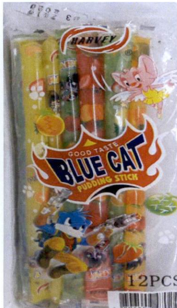
Figure 4. Unregistered HARVEY Blue Cat Pudding Stick