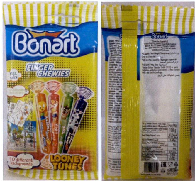
Figure 5. Unregistered BONART Finger Chewies Looney Tunes™ Assorted Flavors

The FDA verified through post-marketing surveillance that the abovementioned food products and food supplement are not registered and the Certificate of Product Registration (CPR) have not yet been issued. Pursuant to the Republic Act No. 9711, otherwise known as the "Food and Drug Administration Act of 2009", the manufacture, importation, exportation,