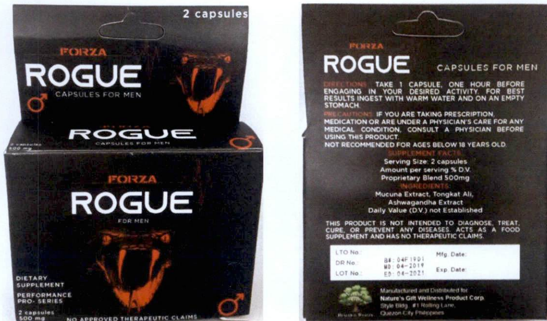
Figure 1. Unregistered FORZA ROGUE for Men Dietary Food Supplement Performance Pro-Series

The Food and Drug Administration (FDA) warns the public from purchasing and consumption of the following unregistered food products and food supplement: