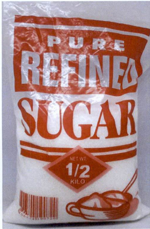
Figure 2. Unregistered PURE Refined Sugar