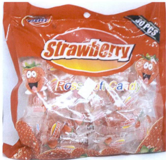
Figure 5. Unregistered HARVEY® Strawberry Ross Soft Candy

The FDA verified through post-marketing surveillance that the abovementioned food products are not registered and the Certificate of Product Registration (CPR) have not yet been issued. Pursuant to the Republic Act No. 9711, otherwise known as the "Food and Drug Administration Act of 2009", the manufacture, importation, exportation, sale, offering for sale, distribution, transfer, non-consumer use, promotion, advertising or sponsorship of health products without the proper authorization is prohibited.