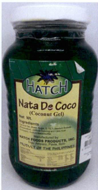
Figure 4. Unregistered HATCH Nata De Coco (Coconut Gel)