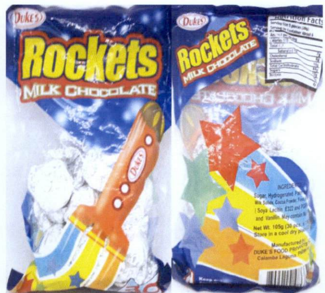
Figure 3. Unregistered DUKE'S Rockets Milk Chocolate