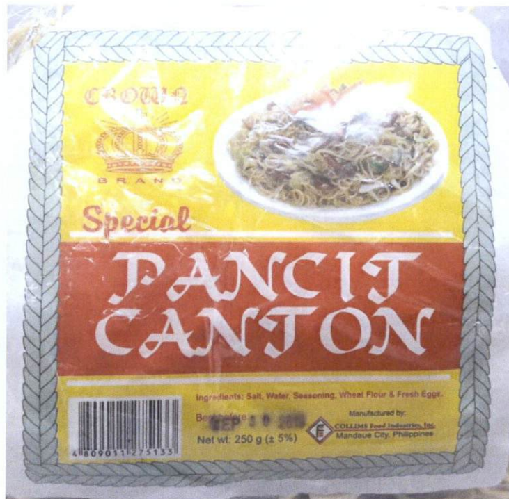
Figure 1. Unregistered CROWN Special Pancit Canton

The Food and Drug Administration (FDA) warns the public from purchasing and consumption of the following unregistered food products: