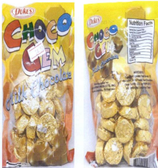
Figure 2. Unregistered DUKE'S Choco Gem Milk Chocolate