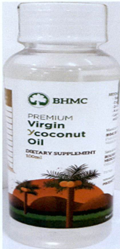
Figure 2. Unregistered BHMC Premium Virgin Ycoconut Oil Dietary Supplement