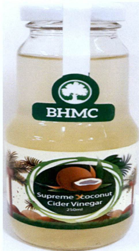
Figure 3. Unregistered BHMC Supreme Ycoconut Cider Vinegar