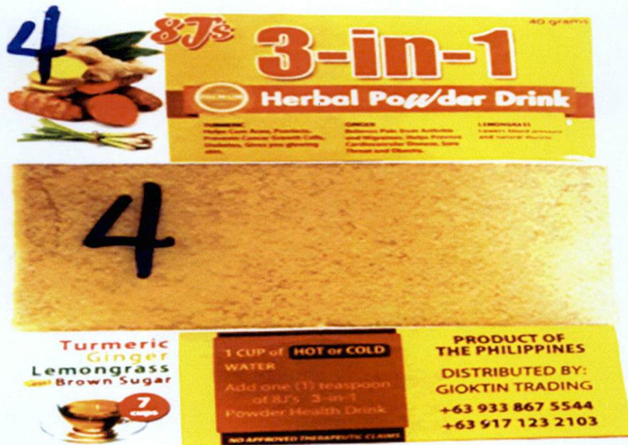
Figure 1. Unregistered 8J's 3-in-1 Herbal Powder Drink

The Food and Drug Administration (FDA) warns the public from purchasing and consuming the following unregistered food products and food supplement: