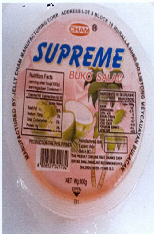
Figure 2. Unregistered CHAM Supreme Buko Salad