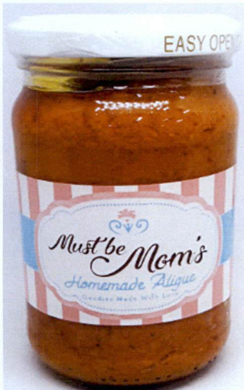
Figure 4. Unregistered MUST BE MOM'S Home Made Alique