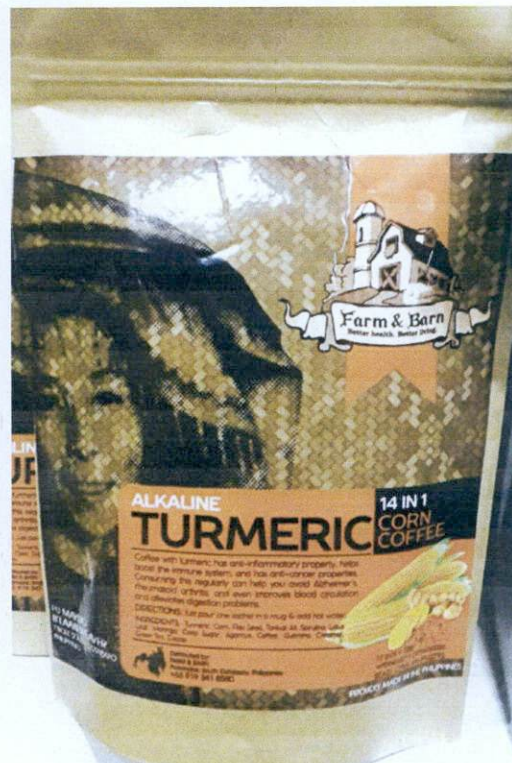
Figure 3. Unregistered ALKALINE TURMERIC 14in1 Corn Coffee