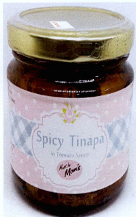
Figure 5. Unregistered MUST BE MOM'S Spicy Tinapa in Tomato Sauce