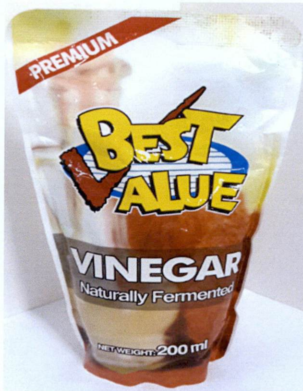
Figure 1. Unregistered PREMIUM BEST VALUE Vinegar, Naturally Fermented

The Food and Drug Administration (FDA) warns the public from purchasing and consuming of the following unregistered food products: