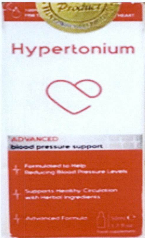
Figure 4. Unregistered HYPERTONIUM Advance Blood Pressure Support Food Supplement