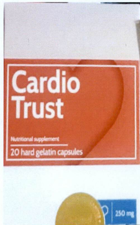
Figure 5. Unregistered CARDIO TRUST Nutritional Supplement Hard Gelatin Capsule