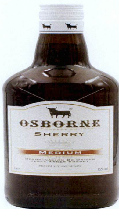
Figure 1. Unregistered OSBORNE Sherry, Medium (Product of Spain)

The Food and Drug Administration (FDA) warns the public from purchasing and consuming of the following unregistered food products and supplements: