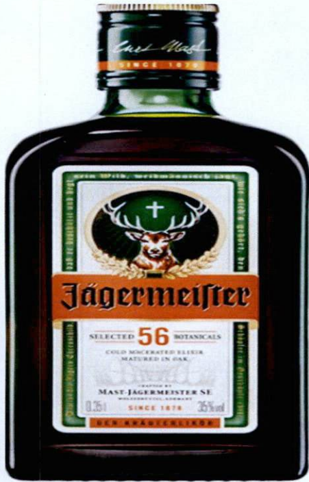
Figure 2. Unregistered JÄGERMEISTER Herb Liqueur (Product of Germany)