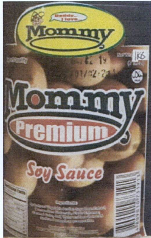
Figure 3. Unregistered MOMMY Premium Soy Sauce