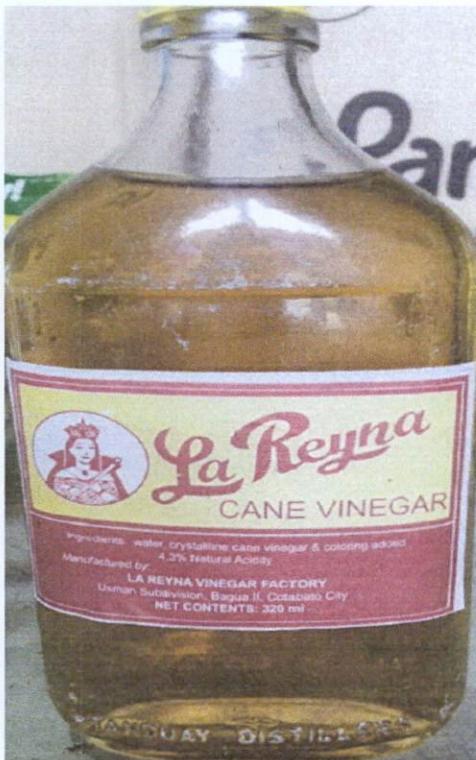
Figure 4. Unregistered LA REYNA Cane Vinegar