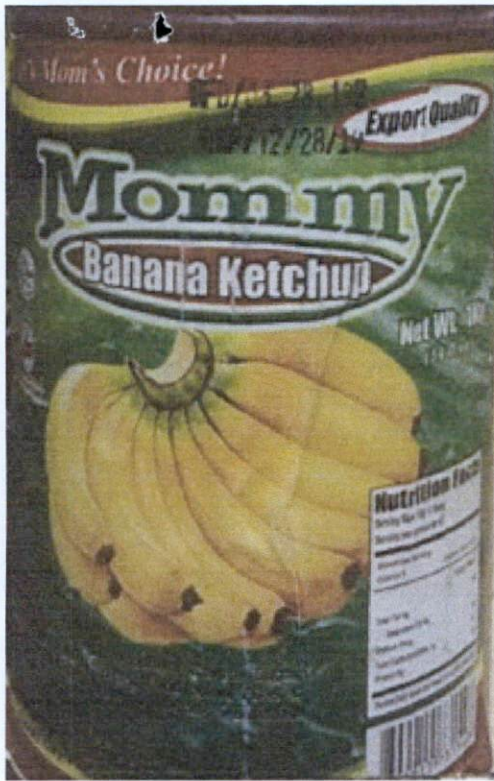
Figure 2. Unregistered MOMMY Banana Ketchup