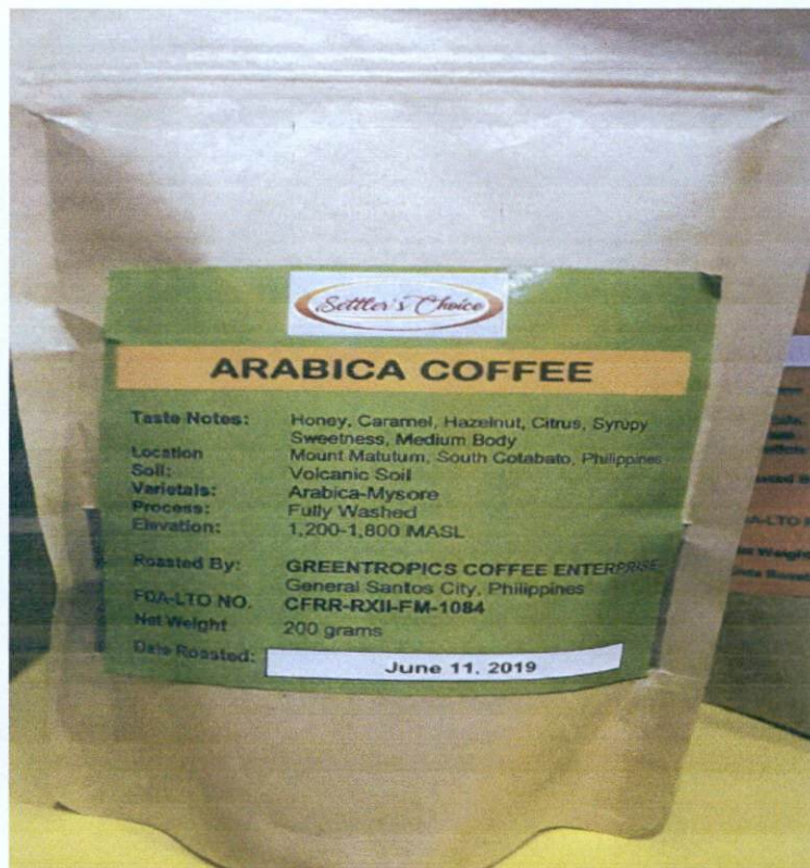
Figure 1. Unregistered SETTLER'S CHOICE Arabica Coffee

The Food and Drug Administration (FDA) warns the public from purchasing and consuming of the following unregistered food products: