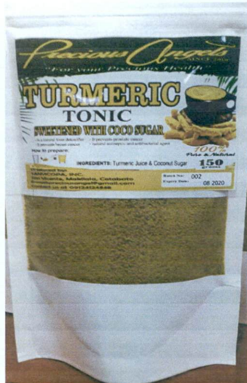
Figure 5. Unregistered PRECIOUS ANGELS Turmeric Tonic Sweetened with Coconut Sugar