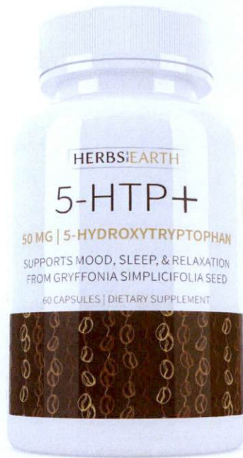
Figure 2. Unregistered HERBS OF THE EARTH 5-HTP + 50 mg 5 HYDROXYTRYPTOPHAN Dietary Supplement (60 capsules)