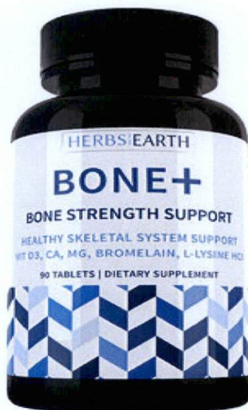
Figure 1. Unregistered HERBS OF THE EARTH BONE+ Bone Strength Support Healthy Skeletal System Support Vitamin D3+ Ca+ Mg+ Bromelain+ L-Lysine HCl Dietary Supplement (90 tablets)

The Food and Drug Administration (FDA) warns the public from purchasing and consuming the following unregistered food supplements: