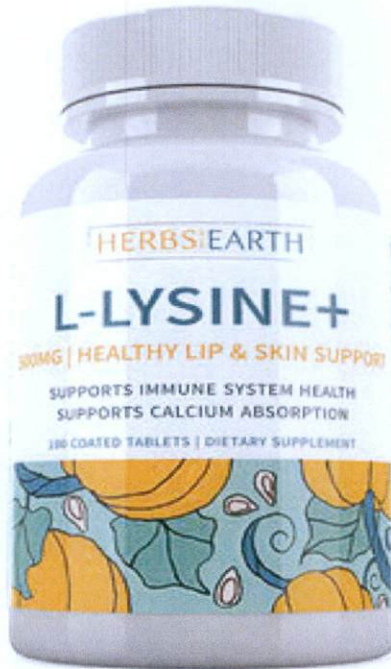
Figure 4. Unregistered HERBS OF THE EARTH L-LYSINE+500mg HEALTHY LIP & SKIN SUPPORT Dietary Supplement (100 coated tablets)