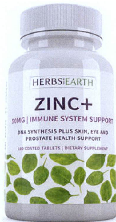
Figure 3. Unregistered HERBS OF THE EARTH ZINC+50mg IMMUNE SYSTEM SUPPORT Dietary Supplement (100 coated tablets)