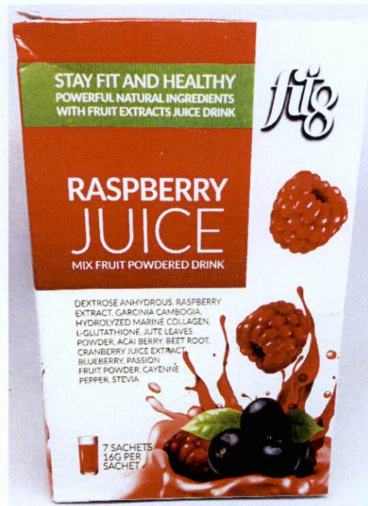
Figure 5. Unregistered FIT8 Raspberry Juice Mix Fruit Powdered Drink