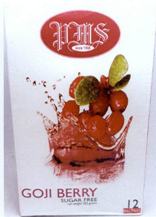
Figure 3. Unregistered PMS Goji Berry Sugar Free