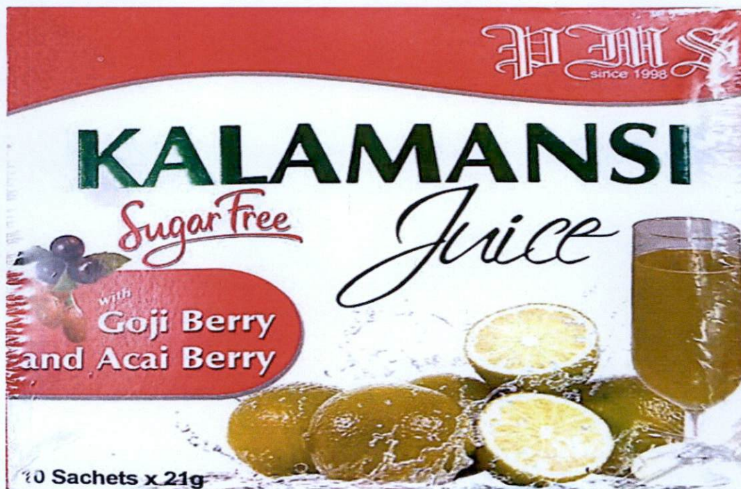
Figure 1. Unregistered PMS Kalamansi Juice with Goji Berry and Acai Berry (Sugar Free)

The Food and Drug Administration (FDA) warns the public from purchasing and consuming the following unregistered food products and food supplement: