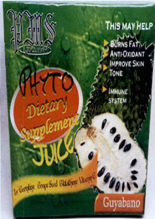
Figure 2. Unregistered PMS Phyto Dietary Supplement Juice with L-Carnitine, Grape Seed, Glutathione and Vitamin C