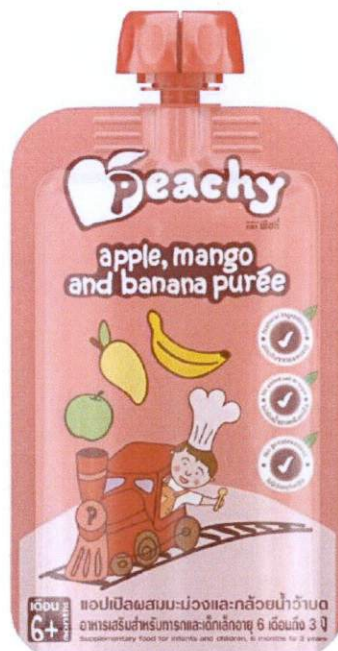
Figure 1. Unregistered PEACHY Apple, Mango and Banana Puree

The Food and Drug Administration (FDA) warns the public from purchasing and consumption of the following unregistered food products: