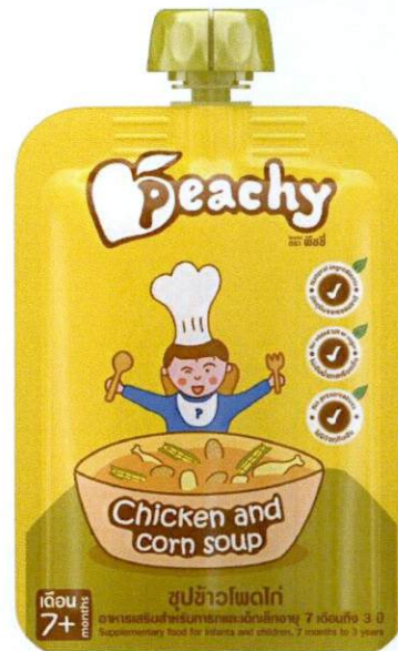
Figure 5. Unregistered PEACHY Chicken and Corn Soup

The FDA verified through post-marketing surveillance that the abovementioned food products are not registered and the Certificate of Product Registration (CPR) have not yet been issued. Pursuant to the Republic Act No. 9711, otherwise known as the “Food and Drug Administration Act of 2009”, the manufacture, importation, exportation, sale, offering for sale, distribution, transfer, non-consumer use, promotion, advertising or sponsorship of health products without the proper authorization is prohibited.