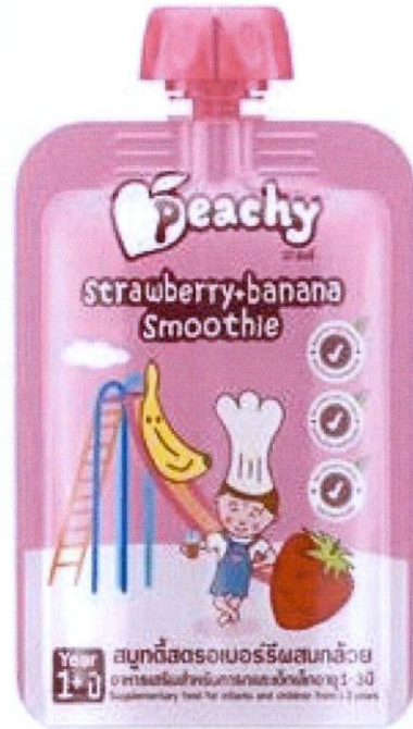
Figure 3. Unregistered PEACHY Strawberry+Banana Smoothie