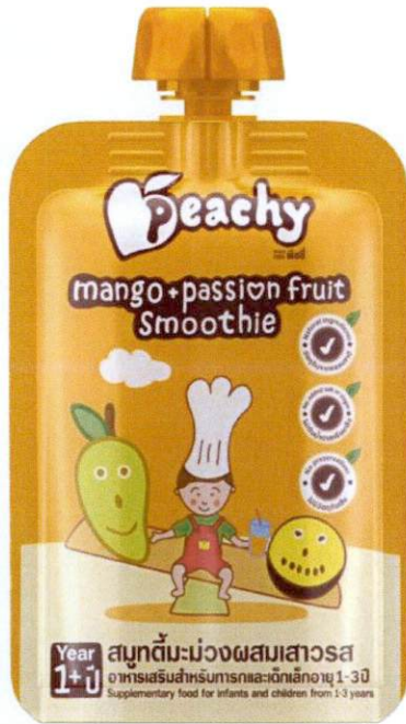
Figure 2. Unregistered PEACHY Mango+Passion Fruit Smoothie