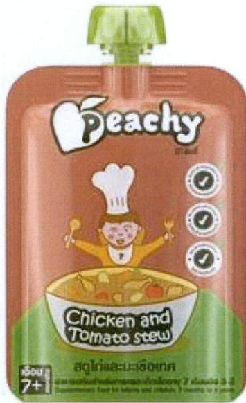
Figure 4. Unregistered PEACHY Chicken and Tomato Stew