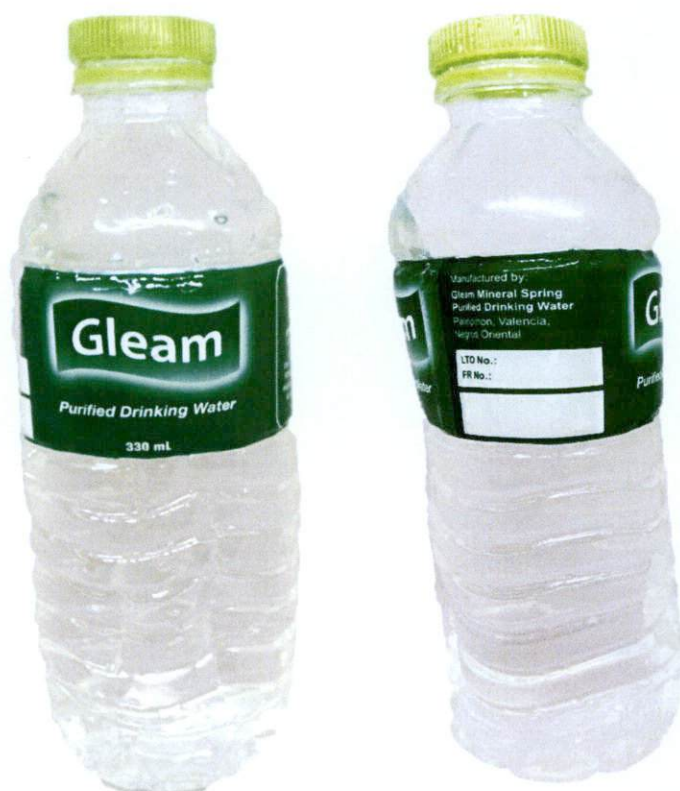
Figure 3. Unregistered GLEAM Purified Drinking Water (330mL)