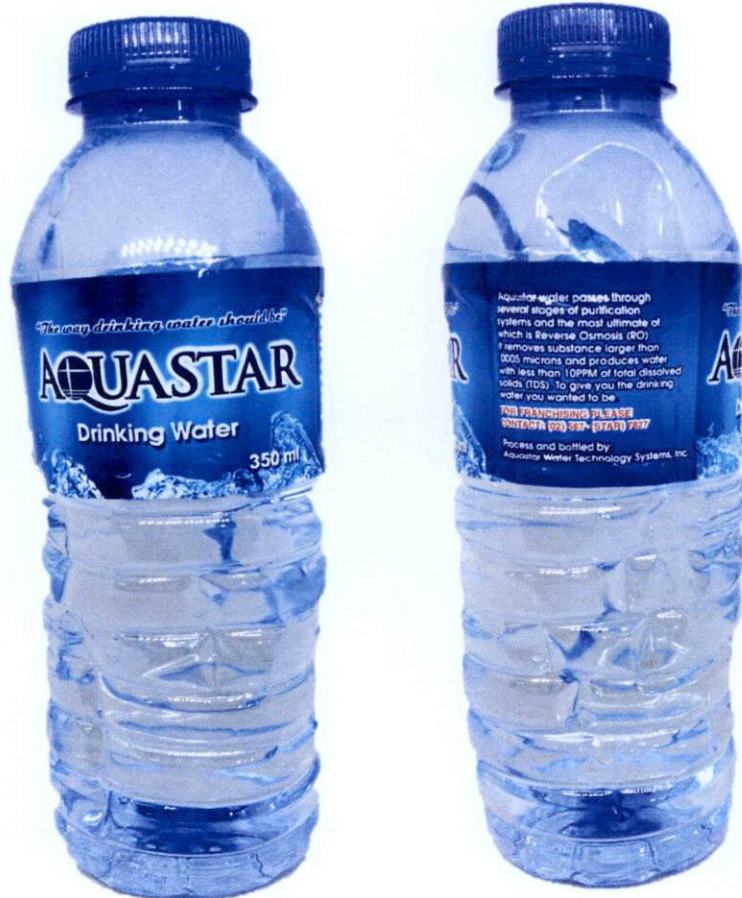
Figure 2. Unregistered AQUASTAR Drinking Water (350mL)