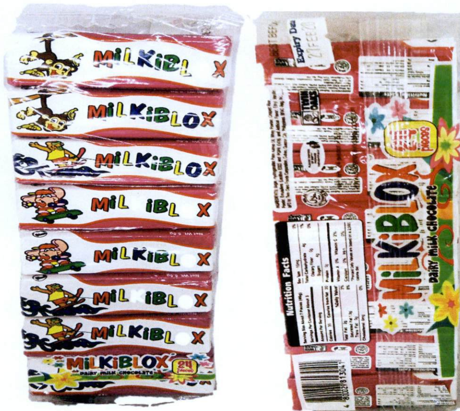
Figure 1. Unregistered MILKIBLOX Dairy Milk Chocolate

The Food and Drug Administration (FDA) warns the public from purchasing and consuming the following unregistered food products: