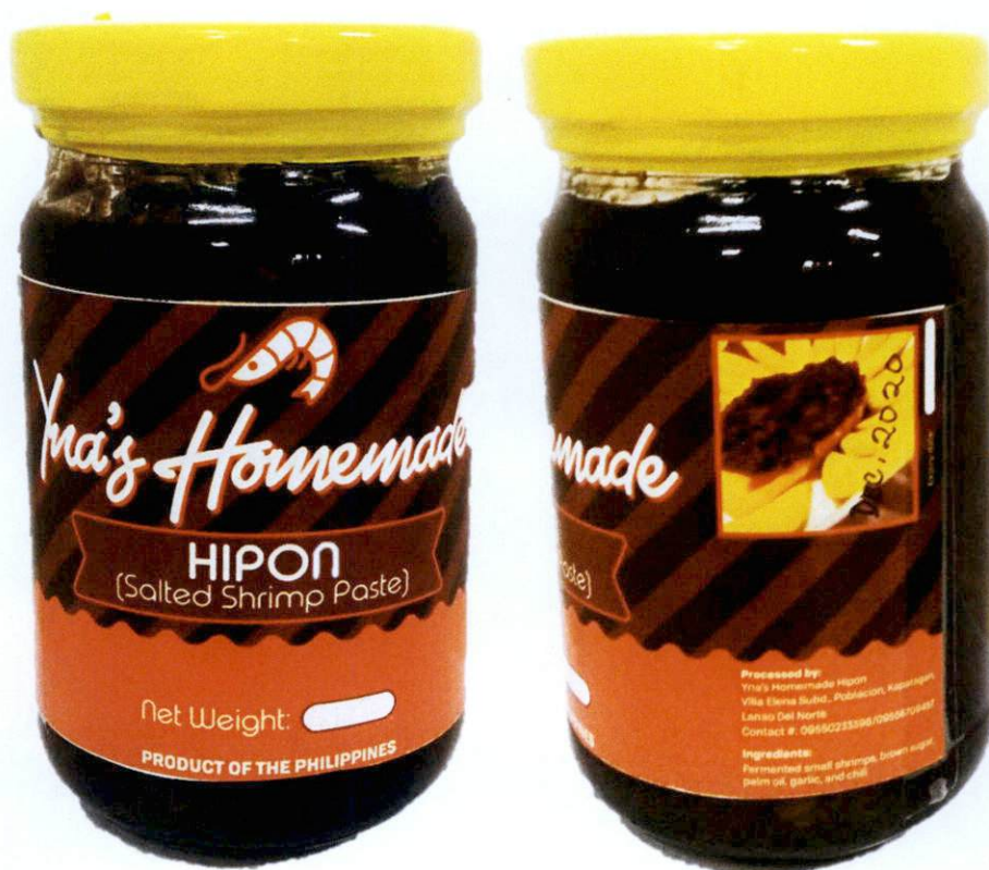
Figure 5. Unregistered YNA'S HOMEMADE Hipon (Salted Shrimp Paste)