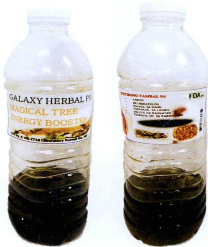
Figure 4. Unregistered GALAXY HERBAL PRODUCT MAGICAL TREE Energy Booster Liquid