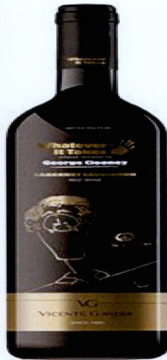
Figure 3. Unregistered GEORGE CLOONEY Cabernet Sauvignon Red Wine Vinotinto