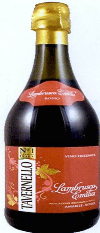
Figure 5. Unregistered TAVERNELLO Vino Frizzante Lambrusco Emilia