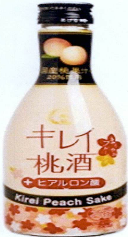
Figure 4. Unregistered KIREI Peach Sake