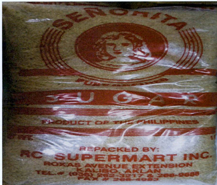
Figure 1. Unregistered SEÑORITA Pure Refined Sugar

The Food and Drug Administration (FDA) warns the public from purchasing and consuming of the following unregistered food products: