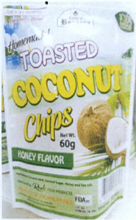
Figure 2. Unregistered CRAFTS OF BORACAY Toasted Coconut Chips, Honey Flavor