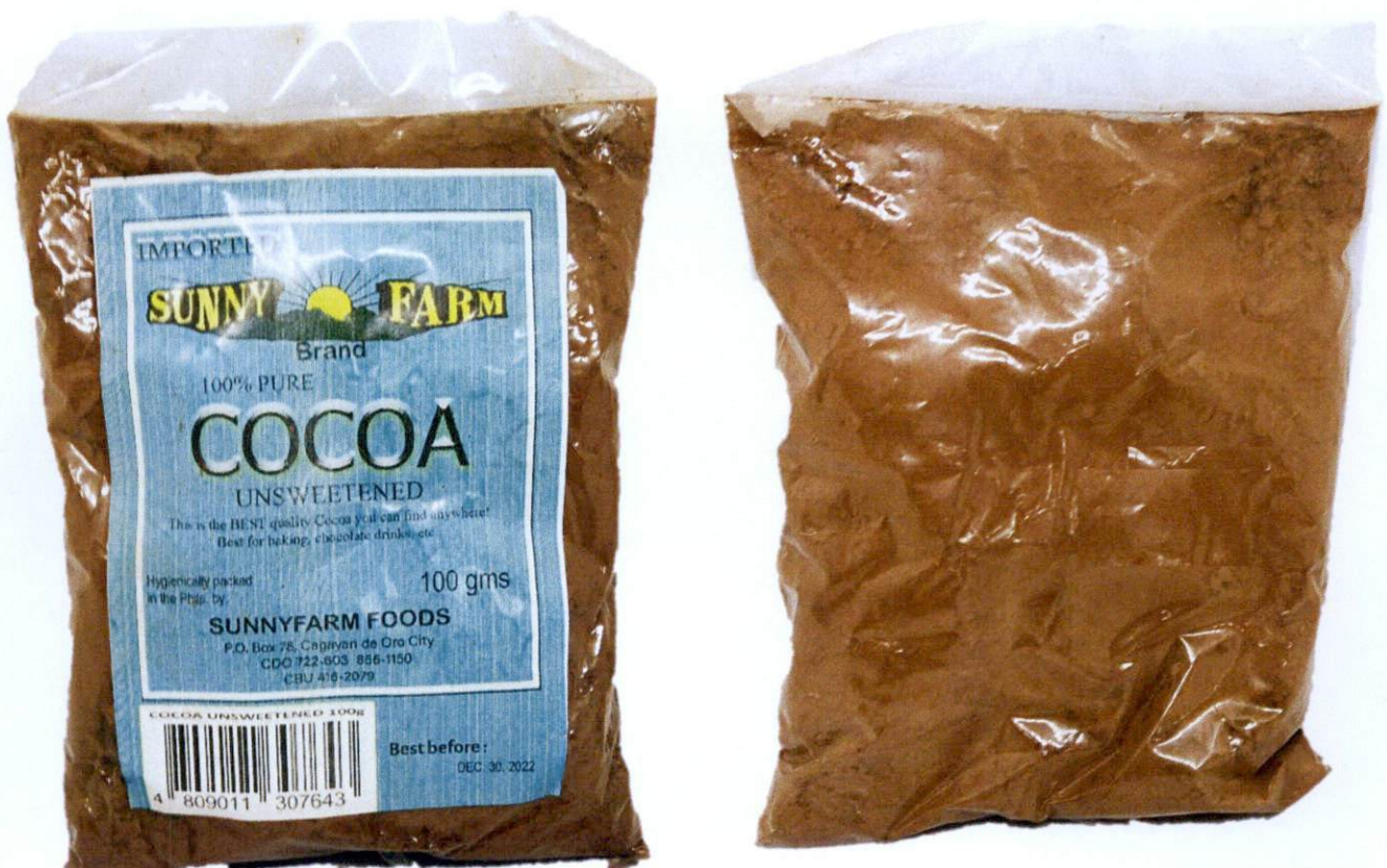
Figure 3. Unregistered IMPORTED SUNNY FARM BRAND 100% Pure Cocoa Unsweetened (100 grams)