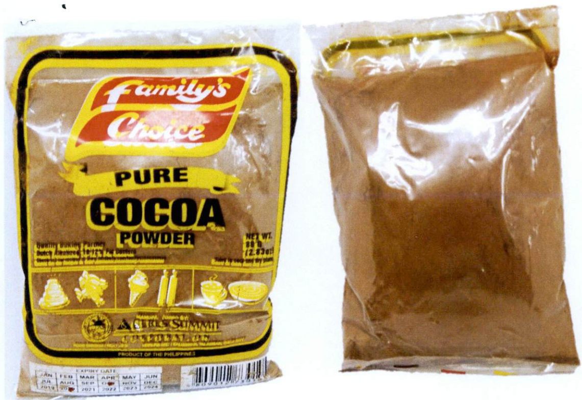
Figure 2. Unregistered FAMILY'S CHOICE Pure Cocoa Powder