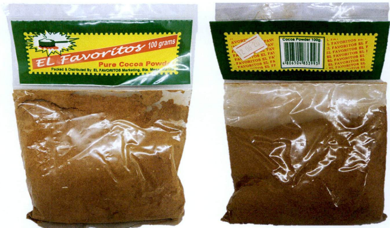
Figure 5. Unregistered EL FAVORITOS Pure Cocoa Powder (100 grams)