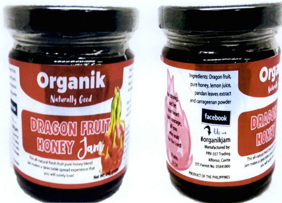
Figure 1. Unregistered ORGANIK NATURALLY GOOD Dragon Fruit Honey Jam (240 grams)

The Food and Drug Administration (FDA) warns the public from purchasing and consuming the following unregistered food products: