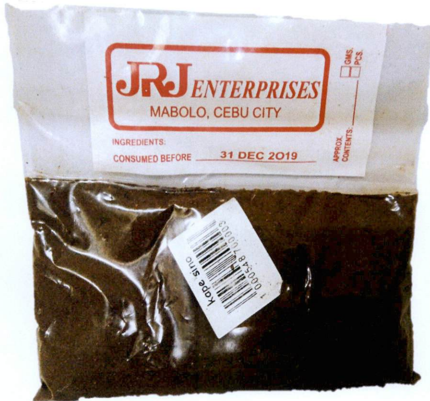
Figure 4. Unregistered JRJ ENTERPRISES Kape Sino