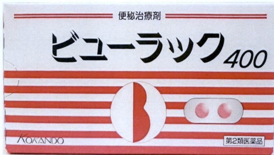
Figure 1. Unregistered KOKANDO Pink Pills (labels are in foreign characters)

The Food and Drug Administration (FDA) warns the public from purchasing and consuming the following food supplements: