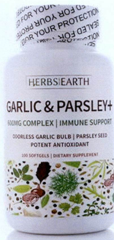
Figure 3. Unregistered HERBS OF THE EARTH Garlic & Parsley Complex Dietary Supplement