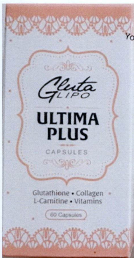
Figure 2. Unregistered GLUTA LIPO Ultima Plus Capsules, Glutathione, Collagen, L-Carnitine Vitamins