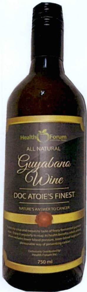
Figure 2. Unregistered HEALTH FORUM Guyabano Wine Doc Atoei's Finest