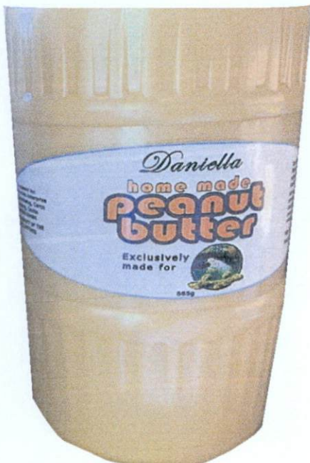
Figure 4. Unregistered DANIELLA Home Made Peanut Butter