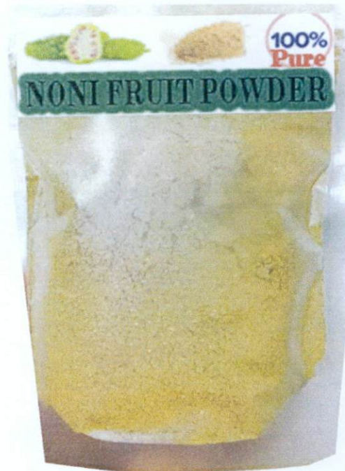
Figure 5. Unregistered Noni Fruit Powder