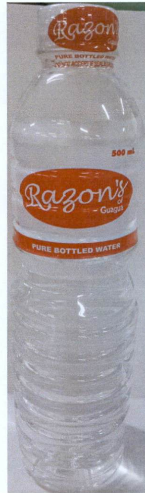
Figure 3. Unregistered RAZON'S OF GUAGUA Pure Bottled Water