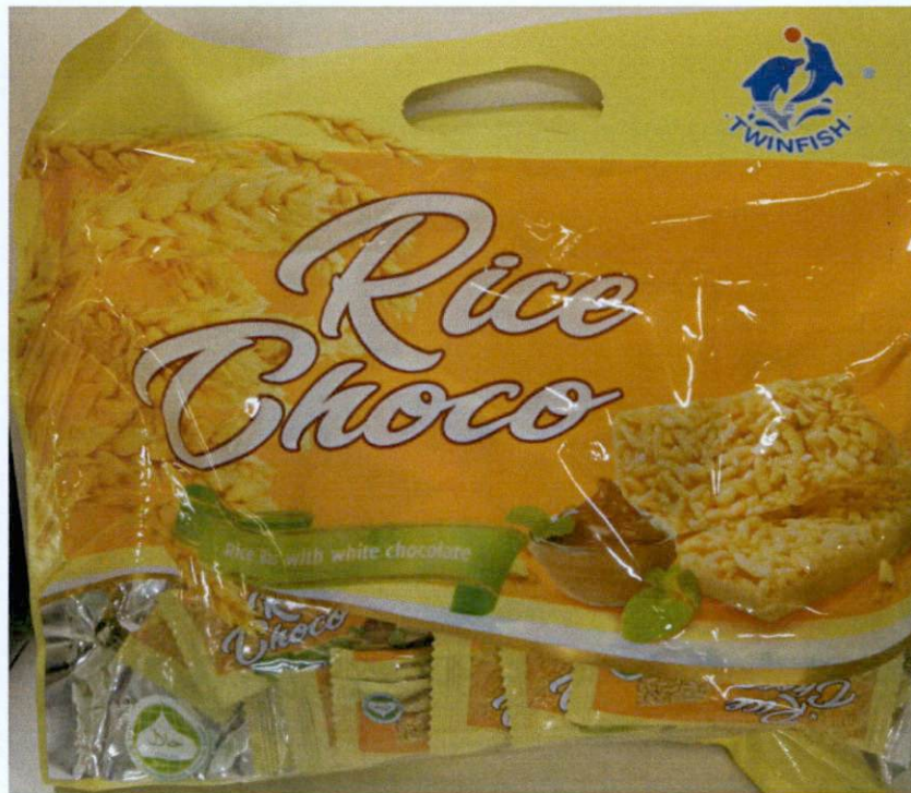
Figure 1. Unregistered TWINFISH Rice Choco Rice Bar with White Chocolate

The Food and Drug Administration (FDA) warns the public from purchasing and consuming the following unregistered food products: