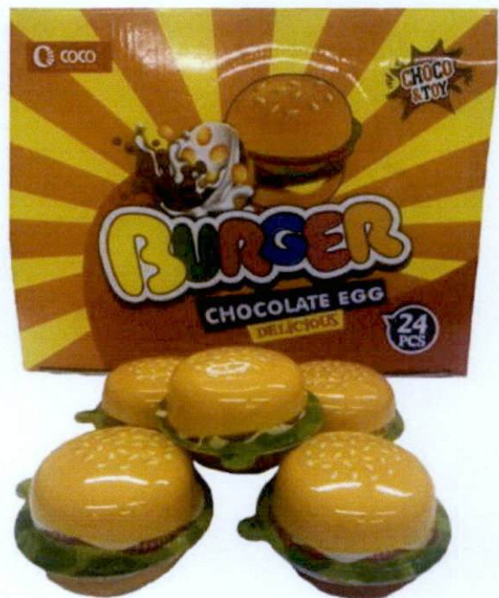
Figure 5. Unregistered COCO FALL INLOVE WITH Burger Chocolate Egg