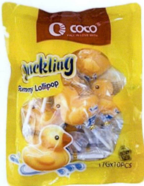
Figure 4. Unregistered COCO FALL INLOVE WITH Duckling Gummy Lollipop