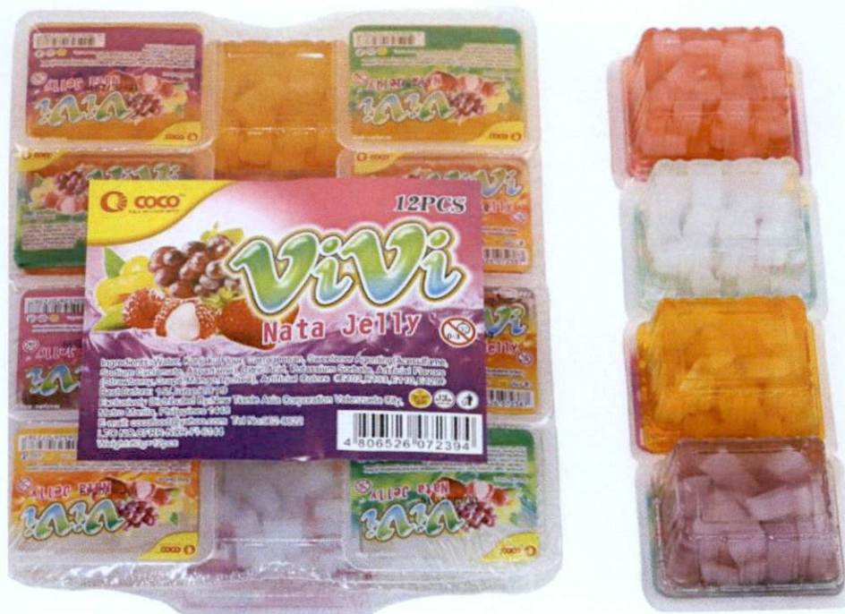
Figure 1. Unregistered COCO FALL INLOVE WITH Vivi Nata Jelly

The Food and Drug Administration (FDA) warns the public from purchasing and consuming the following unregistered food products: