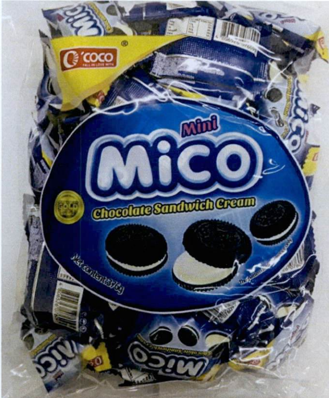
Figure 2. Unregistered COCO FALL INLOVE WITH Mini Mico Chocolate Sandwich Cream