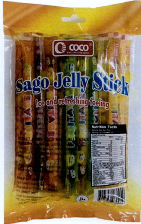
Figure 3. Unregistered COCO FALL INLOVE WITH Sago Jelly Stick