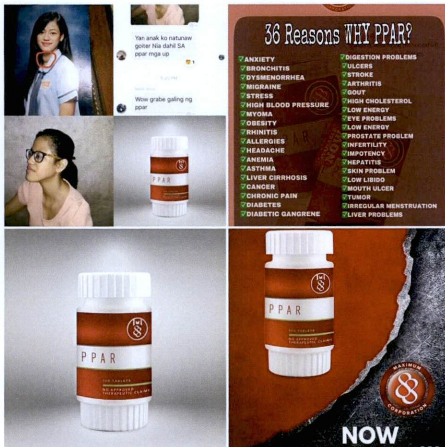
Figure 1. Unapproved claims of M88 PPAR Chlorella+Spirulina+Red Algae+Solweed+Probiotics Food Supplement

The Food and Drug Administration (FDA) warns the public against the following unapproved, false and misleading advertisements and promotion of the product M88 PPAR Chlorella+Spirulina+Red Algae+Solweed+Probiotics Food Supplement monitored in Social Media: