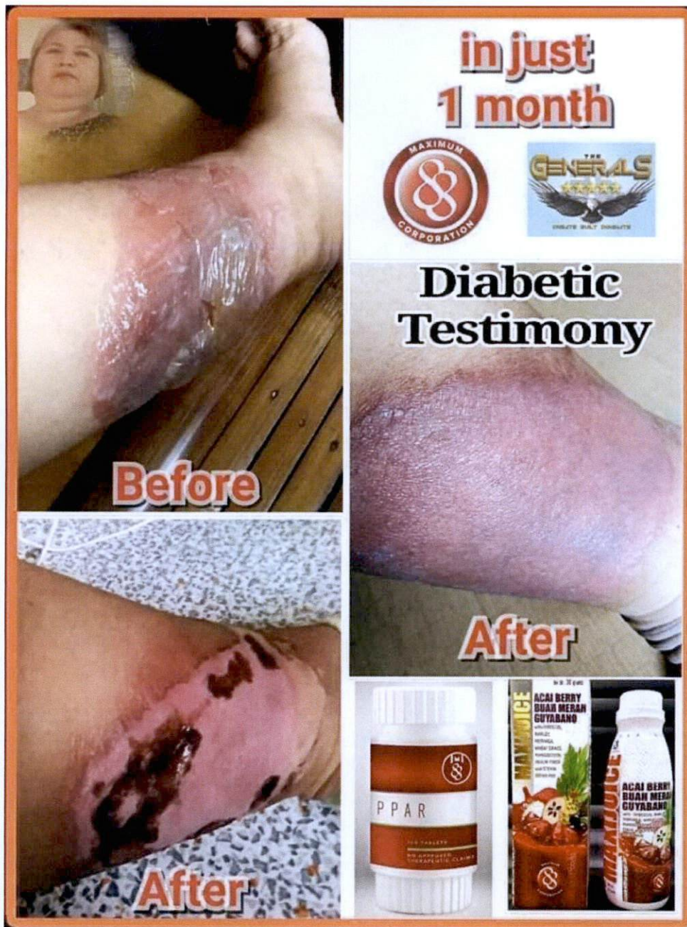
Figure 2. Unapproved claims of M88 PPAR Chlorella+Spirulina+Red Algae+Solweed+Probiotics Food Supplement

The public is hereby warned that the aforementioned claims were not approved by the FDA. Food Products including food supplement should not bear any misleading, deceptive, and false claims in their labels and/or any promotional materials that will provide erroneous impression on product's character or identity.