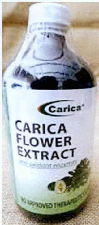
Figure 4. Unregistered CARICA Flower Extract