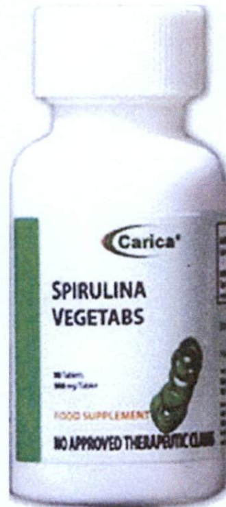
Figure 1. Unregistered CARICA Spirulina Vegetabs

The Food and Drug Administration (FDA) warns the public from purchasing and consuming the following unregistered food supplements: