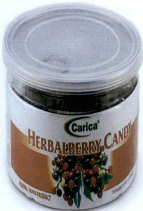
Figure 2. Unregistered CARICA HerbalBerry Candy