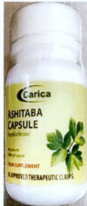
Figure 5. Unregistered CARICA Ashitaba Capsule