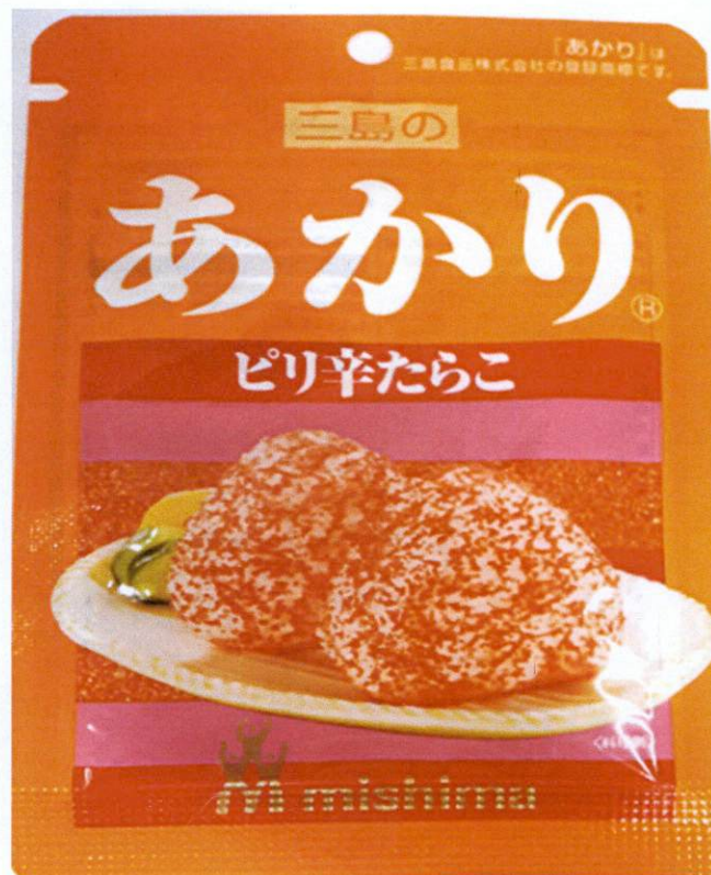
Figure 1. Unregistered MISHIMA Tarako Toppings

The Food and Drug Administration (FDA) warns the public from purchasing and consuming the following unregistered food products: