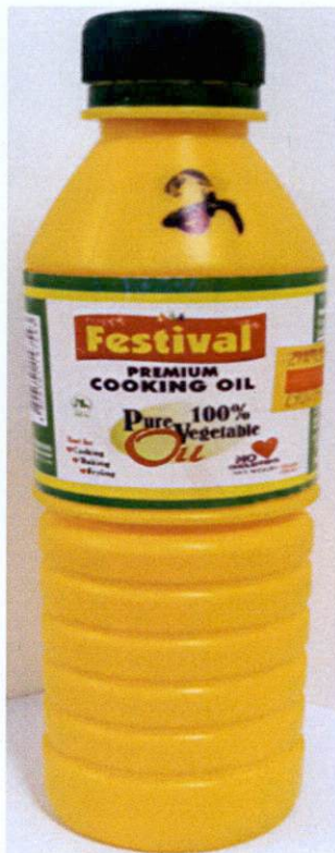
Figure 3. Unregistered HAPPY FESTIVAL Premium Cooking Oil 100% Pure Vegetable Oil