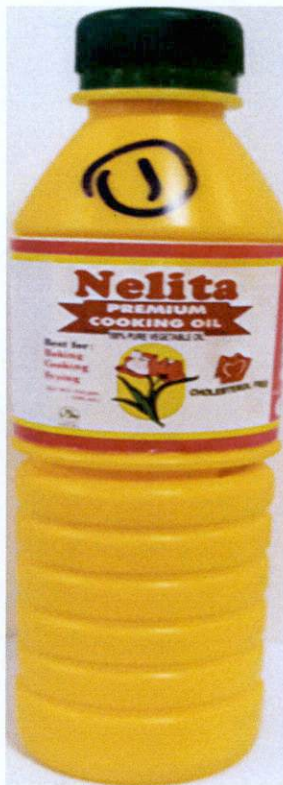
Figure 2. Unregistered NELITA Premium Cooking Oil 100% Pure Vegetable Oil