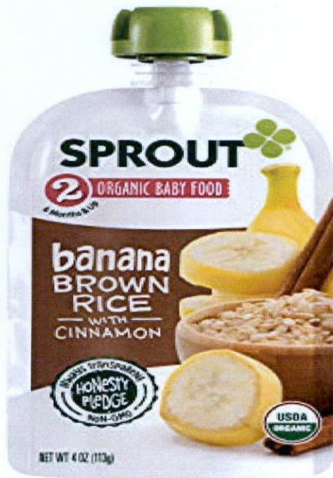
Figure 4. Unregistered SPROUT ORGANIC BABY FOOD Banana Brown Rice with Cinnamon