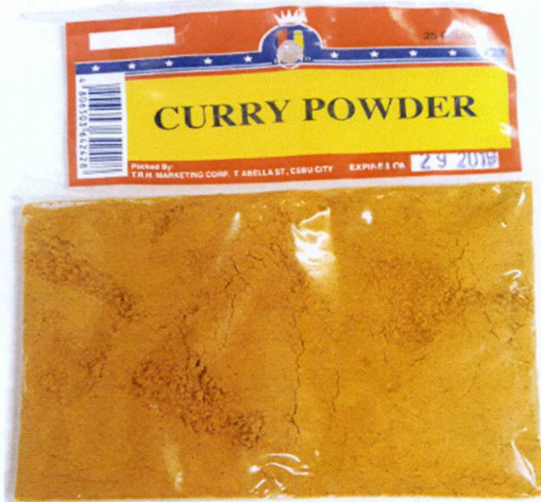
Figure 1. Unregistered TJ BRAND Curry Powder

The Food and Drug Administration (FDA) warns the public from purchasing and consuming the following unregistered food products: