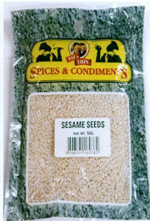
Figure 3. Unregistered FAT & THIN SPICES AND CONDIMENT'S Sesame Seeds