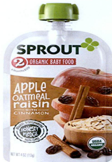
Figure 5. SPROUT ORGANIC BABY FOOD Apple Oatmeal Raisin with Cinnamon