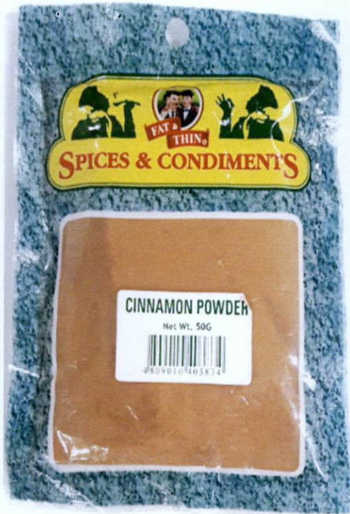
Figure 2. Unregistered FAT & THIN SPICES AND CONDIMENT'S Cinnamon Powder