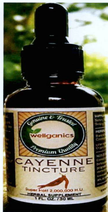
Figure 5. Unregistered WELLGANICS "LIVE WELL, LIVE FREE" Cayenne Tincture Herbal Supplements