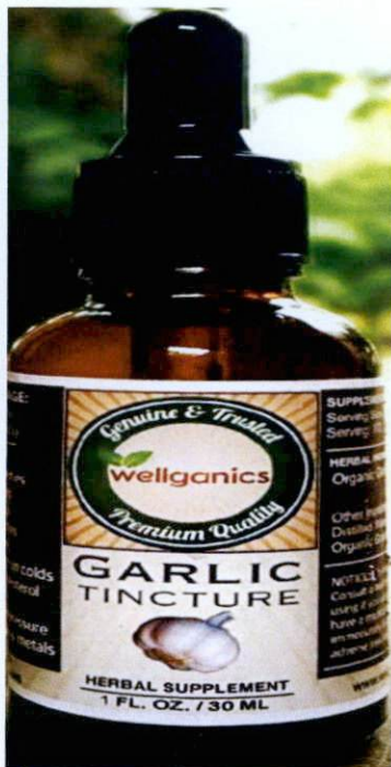
Figure 4. Unregistered WELLGANICS "LIVE WELL, LIVE FREE" Garlic Tincture Herbal Supplements