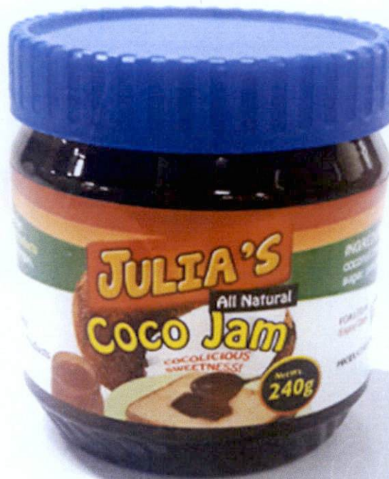
Figure 1. Unregistered JULIA'S All Natural Coco Jam

The Food and Drug Administration (FDA) warns the public from purchasing and consuming the following unregistered food products and food supplements: