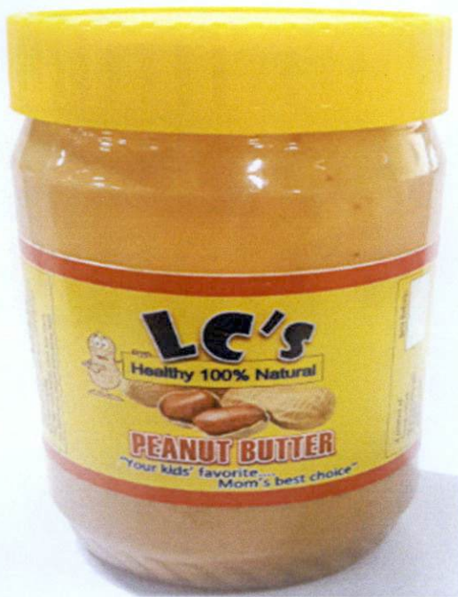
Figure 2. Unregistered LC's Healthy 100% Natural Peanut Butter