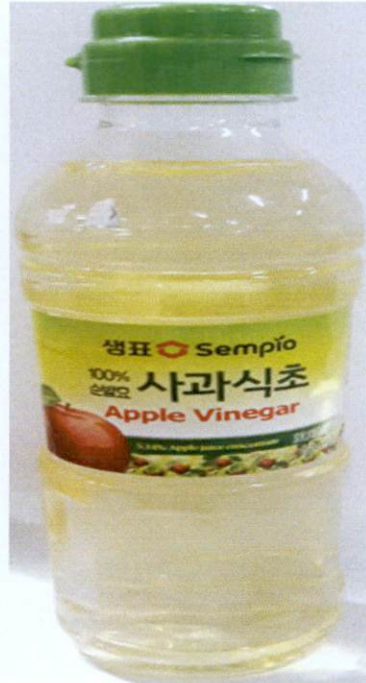
Figure 3. Unregistered SEMPIO Apple Vinegar