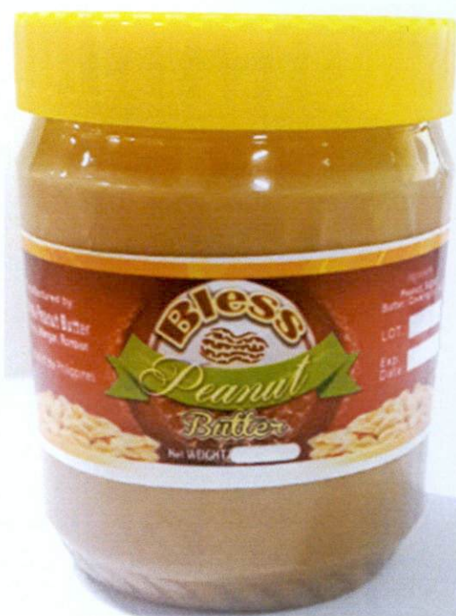
Figure 5. Unregistered BLESS Peanut Butter