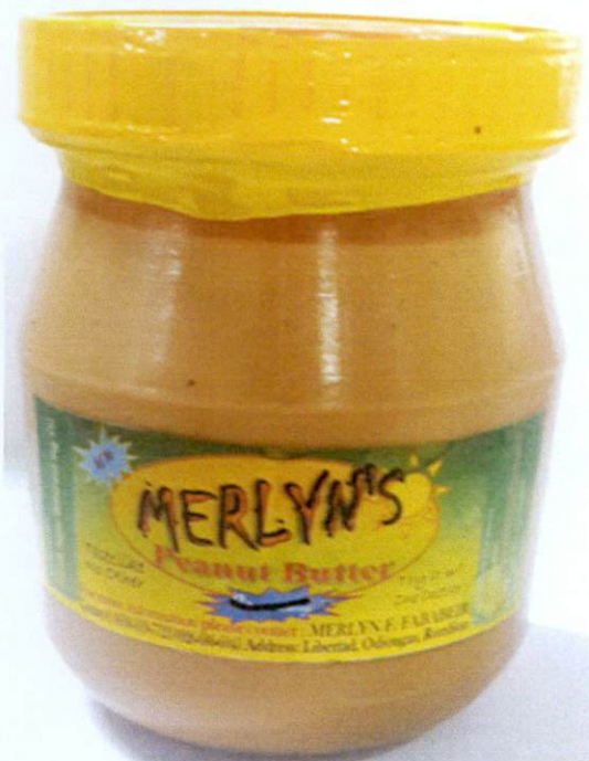
Figure 4. Unregistered MERLYN'S Peanut Butter