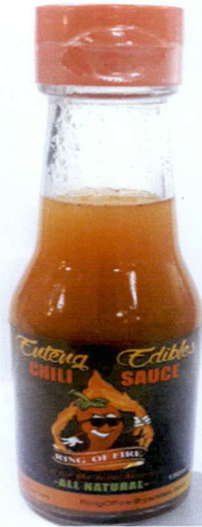
Figure 3. Unregistered ENTENG EDIBLES King of Fire Chili Sauce All Natural