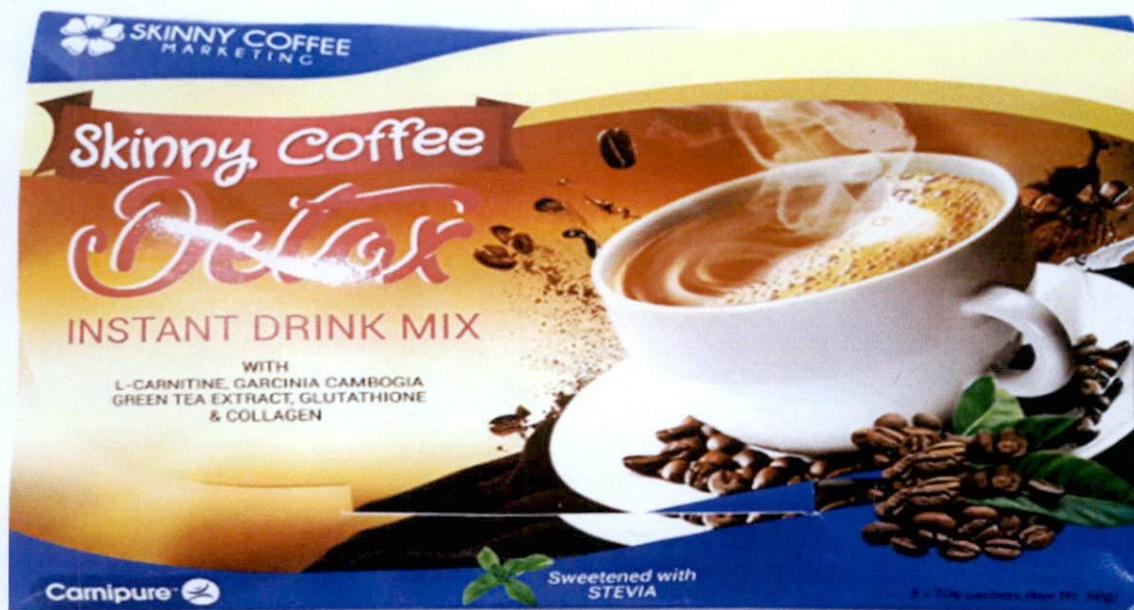
Figure 1. Unregistered SKINNY COFFEE DETOX Instant Drink Mix with L-Carnitine, Garcinia Cambogia, Green Tea Extract, Glutathione & Collagen

The Food and Drug Administration (FDA) warns the public from purchasing and consuming the following unregistered food products: