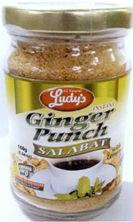
Figure 2. Unregistered LUDY'S Instant Ginger Punch Salabat with Lemon