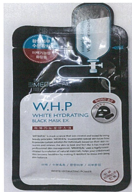
Figure 5. Unnotified Mediheal W.H.P. White Hydrating Black Mask Ex.

The FDA verified through post-marketing surveillance (PMS) that the abovementioned cosmetic products are not authorized and the Certificates of Product Notification have not been issued. Pursuant to Republic Act No. 9711, otherwise known as the “Food and Drug Administration Act of 2009”, the manufacture, importation, exportation, sale, offering for sale, distribution, transfer, non-consumer use, promotion, advertising or sponsorship of health products without the proper authorization from FDA is prohibited.