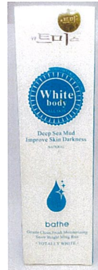
Figure 3. Unnotified White Body All Skin Deep Sea Mud Natural