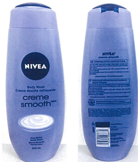
Figure 1. Unnotified Nivea® Crème Smooth Body Wash Shea Butter

The Food and Drug Administration (FDA) warns the public from purchasing and using the following unnotified cosmetic products: