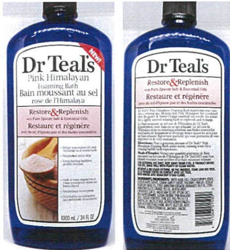
Figure 2. Unnotified Dr. Teal's® Pink Himalayan Foaming Bath