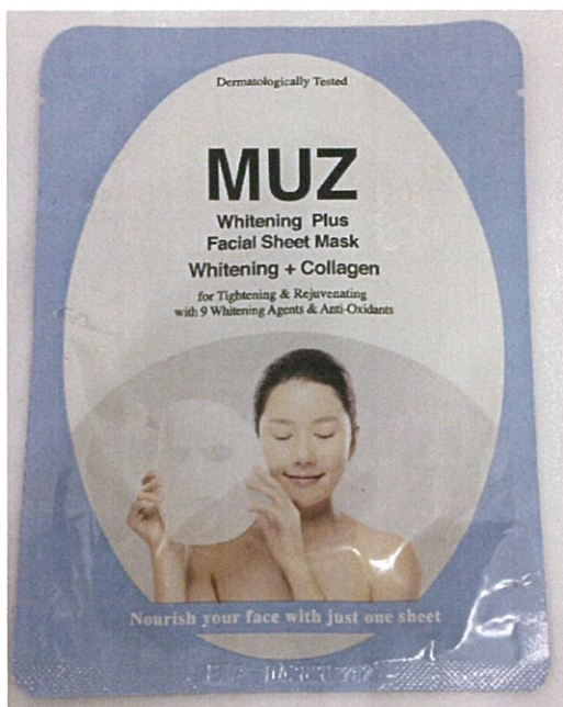
Figure 4. Unnotified Muz Whitening Plus Facial Sheet Mask Whitening + Collagen