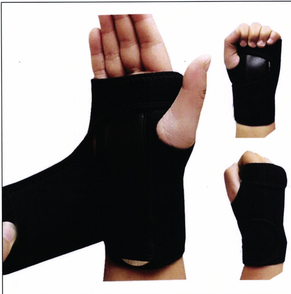
Figure 1. Unregistered 1Pair Left+Right Bandage Orthopedic Hand Brace Wrist Support Finger Splint Carpal Tunnel Syndrom

The Food and Drug Administration (FDA) warns all healthcare professionals and the general public against the purchase and use of the unregistered medical device: