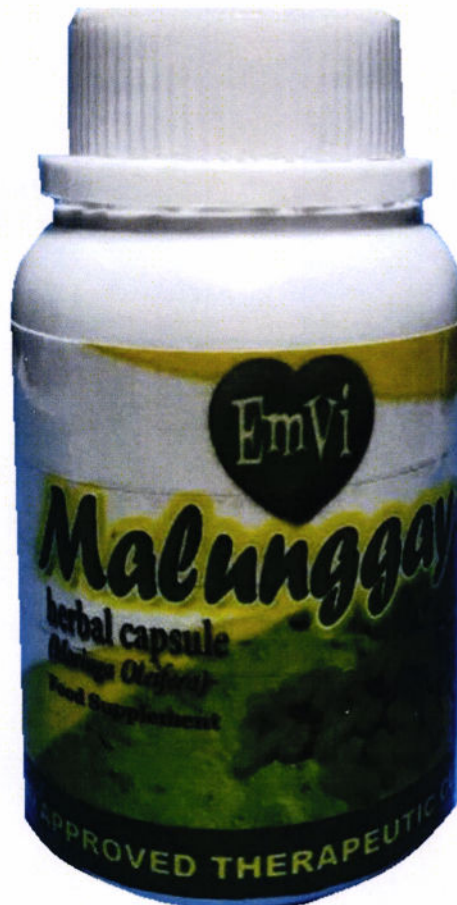
Figure1. EMVI Malunggay Herbal Capsule with Registration Number FR-4000004834111

The Food and Drug Administration (FDA) informs the public that the food supplement EMVI MALUNGGAY HERBAL CAPSULE has been registered by the Market Authorization Holder (MAH), EMVI HERBAL PRODUCTS, in accordance to existing FDA rules and regulations: