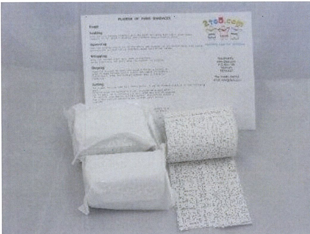
Figure 3. Unregistered Modroc Plaster of Paris Bandage 8cm x 3m x 3 rolls