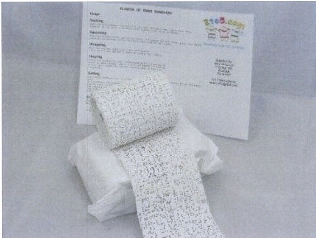
Figure 2. Unregistered Modroc Plaster of Paris Bandage 8cm x 3m x 3 rolls