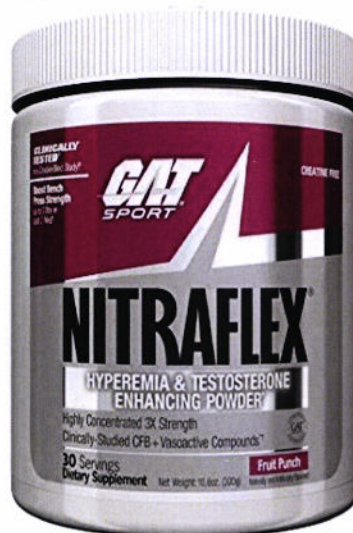
Figure 1. Unregistered GAT SPORT NITRAFLEX® Hyperemia & Testosterone Enhancing Powder Fruit Punch Flavor Dietary Supplement (30 servings)

The Food and Drug Administration (FDA) warns the public from purchasing and consuming the following unregistered food supplements: