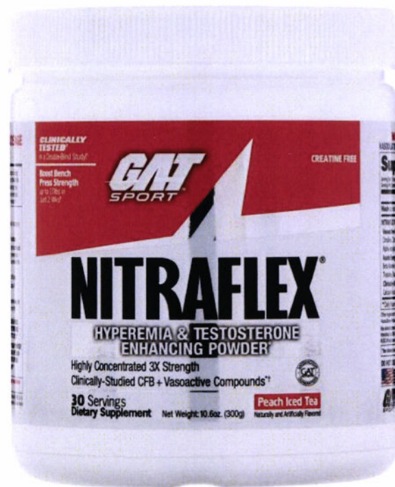
Figure 2. Unregistered GAT SPORT NITRAFLEX® Hyperemia & Testosterone Enhancing Powder Peach Iced Tea Flavor Dietary Supplement (30 servings)