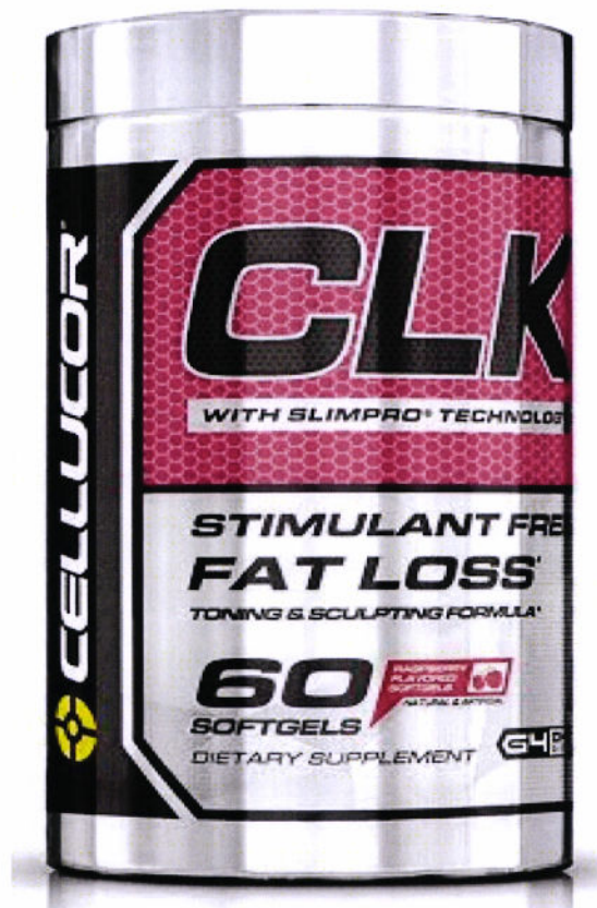
Figure 5. Unregistered CELLUCOR CLK Stimulant Free Fat Loss Dietary Supplement (60 softgels)