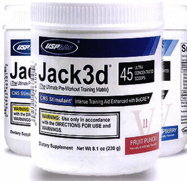
Figure 3. Unregistered USPLABS® JACK3D® The Ultimate Pre-Workout Training Matrix CNS Stimulant Intense Training Aid Enhanced with BioCRE™ Dietary Supplement