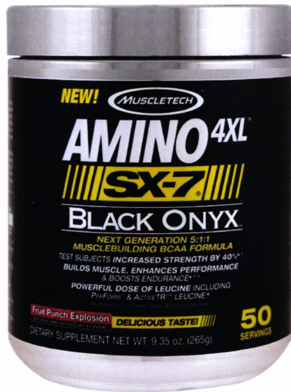
Figure 4. Unregistered MUSCLETECH AMINO 4XL SX-7 BLACK ONYX Next Generation 5:1:1 Muscle Building BCAA Formula Fruit Punch Explosion Dietary Supplement (50 servings)