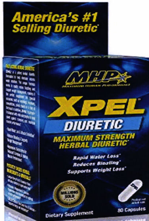
Figure 2. Unregistered MHP MAXIMUM HUMAN PERFORMANCE XPEL Diuretic Maximum Strength Herbal Diuretic Dietary Supplement (80 capsules)