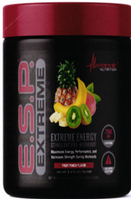
Figure 4. Unregistered E.S.P EXTREME Extreme Energy Stimulant Pre-Workout Fruit Punch Flavor Dietary Supplement (10 oz.)