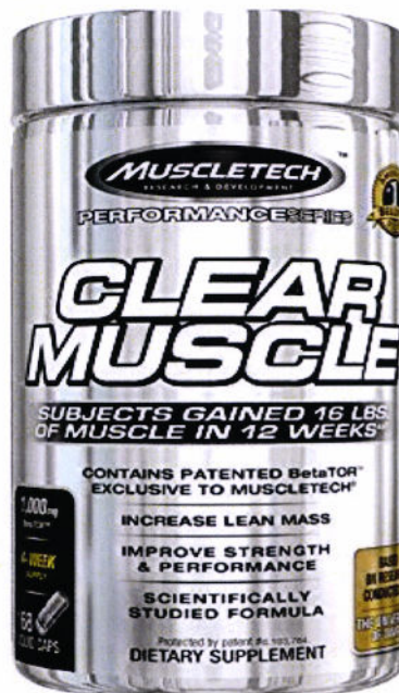
Figure 1. Unregistered MUSCLETECH PERFORMANCE SERIES Clear Muscle Dietary Supplement (168 capsules)

The Food and Drug Administration (FDA) warns the public from purchasing and consuming the following unregistered food supplements: