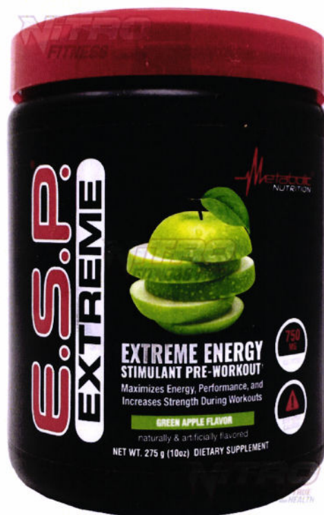
Figure 5. Unregistered E.S.P EXTREME Extreme Energy Stimulant Pre-Workout Apple Flavor Dietary Supplement (10 oz.)