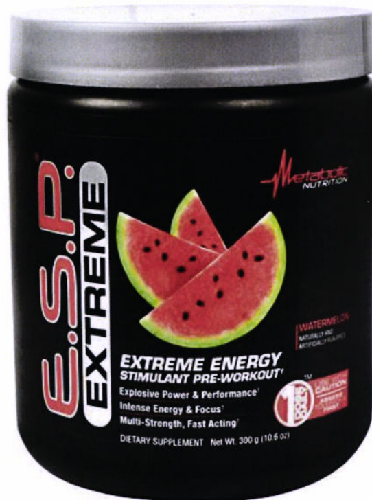
Figure 3. Unregistered E.S.P EXTREME Extreme Energy Stimulant Pre-Workout Watermelon Flavor Dietary Supplement (10 oz.)