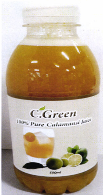
Figure 2. Unregistered C. GREEN 100% Pure Calamansi Juice