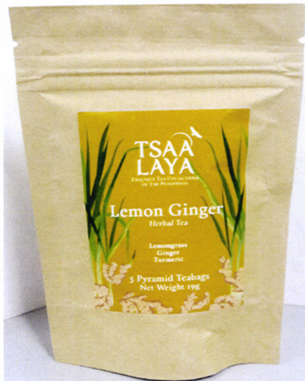
Figure 1. Unregistered TSAA LAYA Lemon Ginger Herbal Tea

The Food and Drug Administration (FDA) warns the public from purchasing and consuming the following unregistered food products: