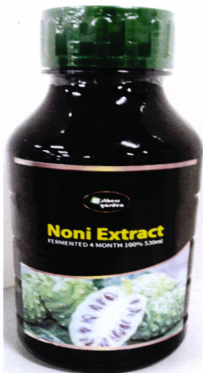
Figure 4. Unregistered MOTHERS GARDEN Extract Fermented 4 Month 100%