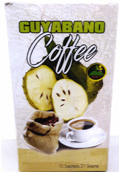
Figure 5. Unregistered MORINGA MOUNTAIN TRADING Guyabano Coffee