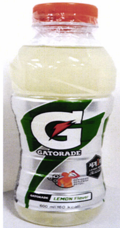
Figure 3. Unregistered GATORADE Lemon Flavor