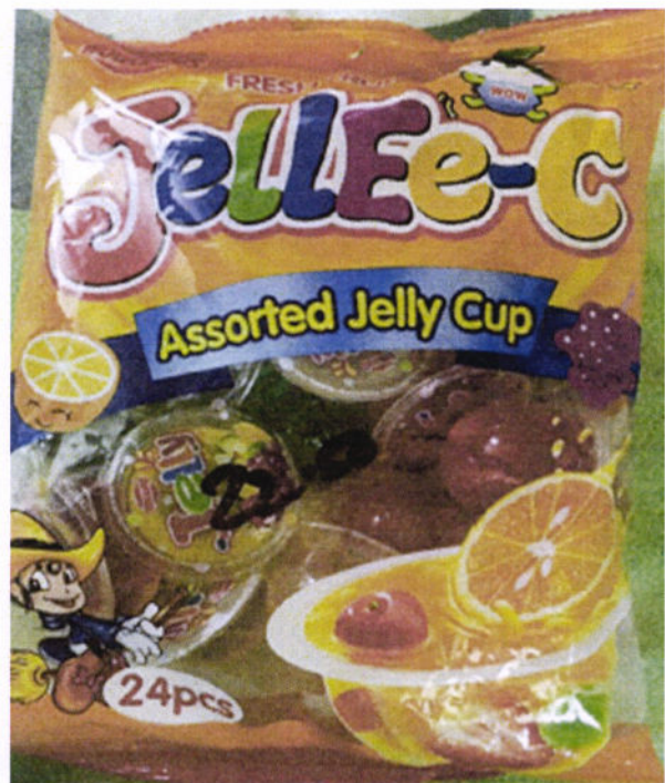
Figure 5. Unregistered FRESH FRUIT JellEe-C Assorted Jelly Cup