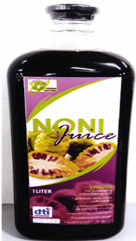
Figure 1. Unregistered ESTAMPADOR HERBAL TRADING Noni Juice

The Food and Drug Administration (FDA) warns the public from purchasing and consuming the following unregistered food products: