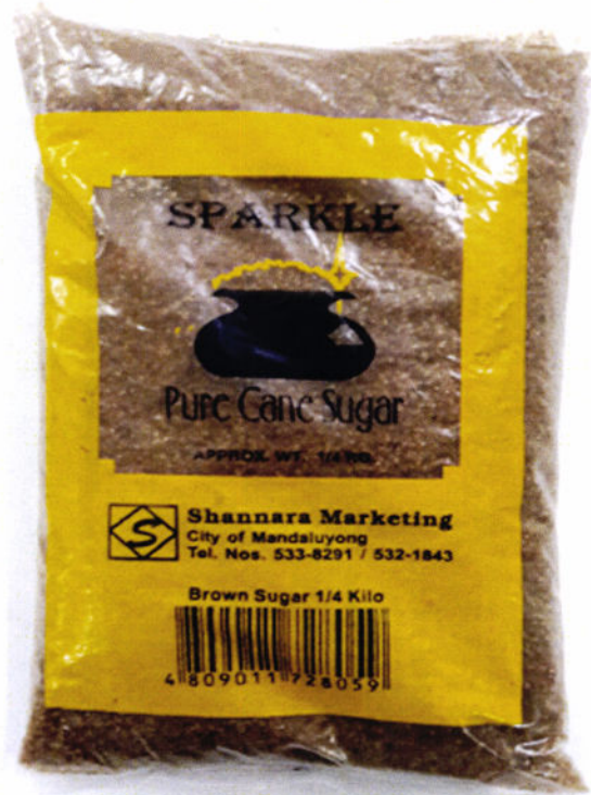
Figure 3. Unregistered SPARKLE Pure Cane Sugar