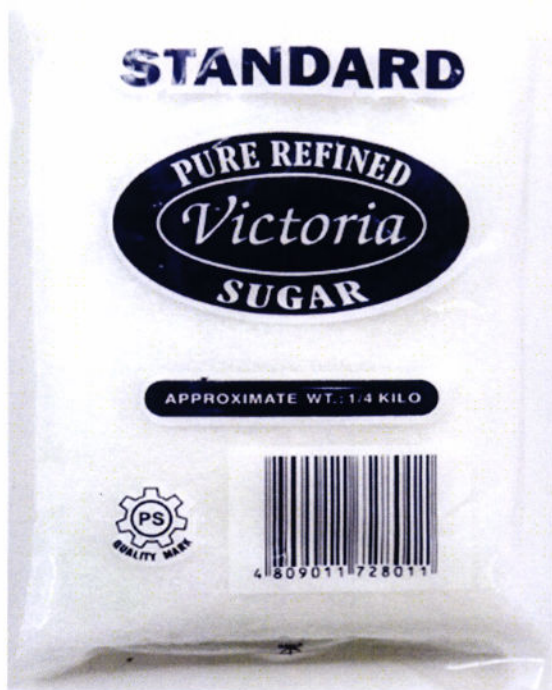
Figure 2. Unregistered VICTORIA Standard Pure Refined Sugar