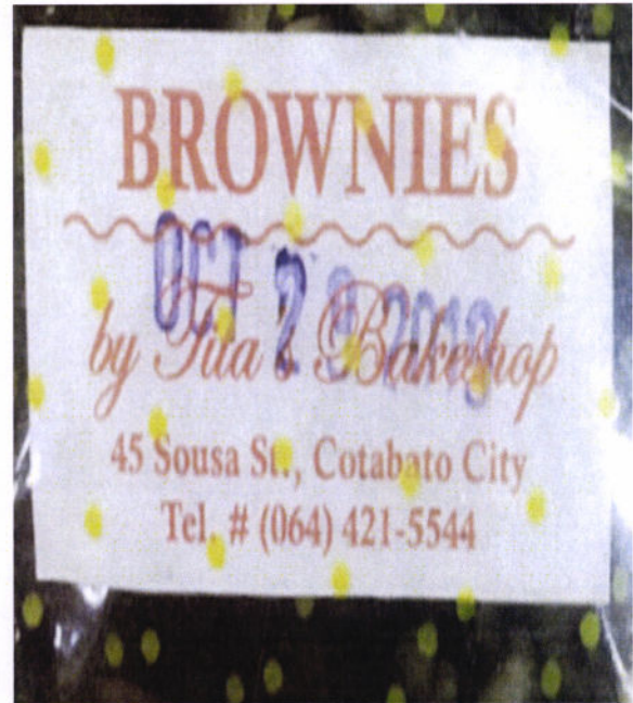
Figure 3. Unregistered TITA'S BAKESHOP Brownies