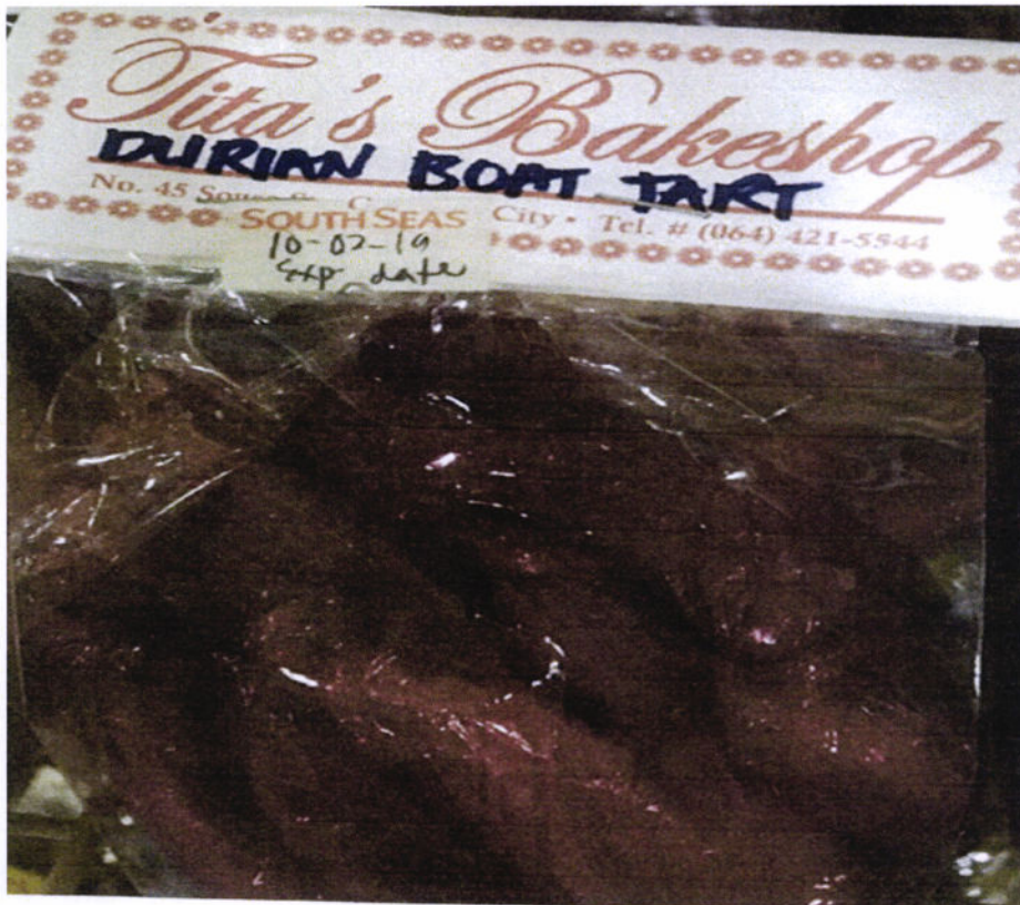
Figure 1. Unregistered TITA'S BAKESHOP Durian Boat Tart

The Food and Drug Administration (FDA) warns the public from purchasing and consuming the following unregistered food products: