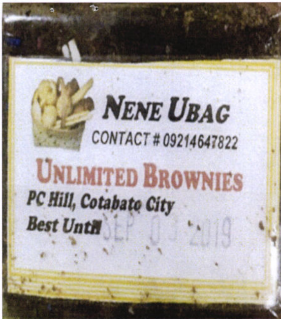
Figure 2. Unregistered NENE UBAG Unlimited Brownies