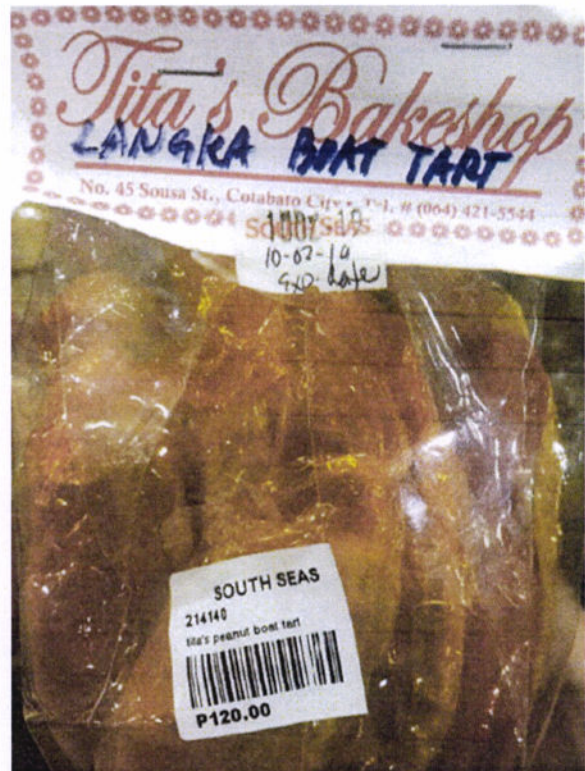
Figure 5. Unregistered TITA'S BAKESHOP Langka Boat Tart