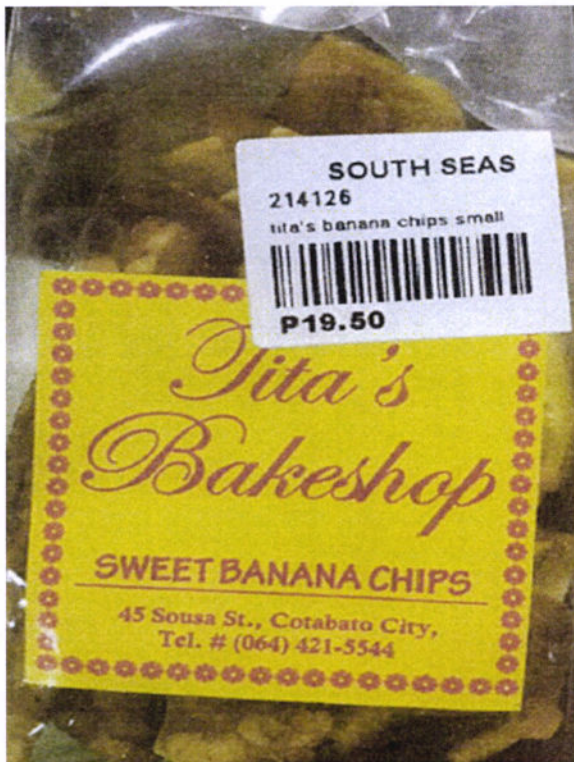
Figure 4. Unregistered TITA'S BAKESHOP Sweet Banana Chips (Small)