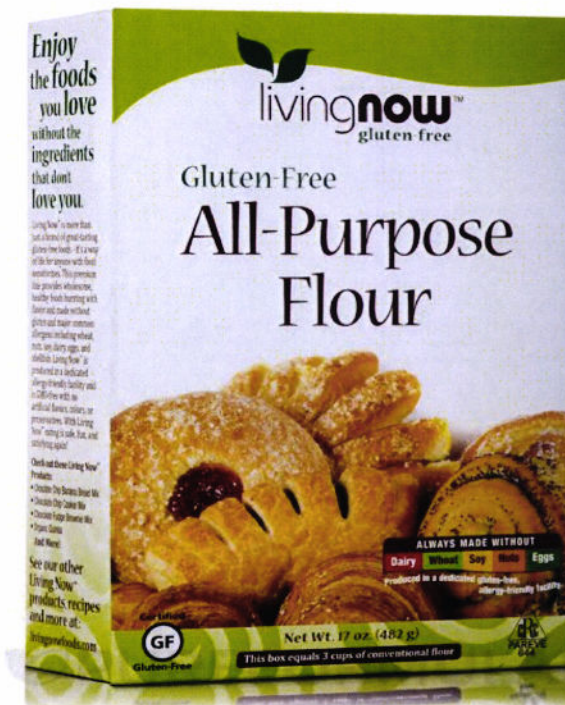
Figure 3. Unregistered LIVING NOW GLUTEN FREE Gluten-Free All-Purpose Flour (482 grams)