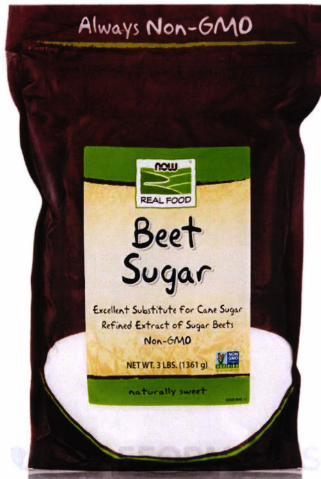
Figure 2. Unregistered NOW REAL FOOD Beet Sugar (1361 grams)