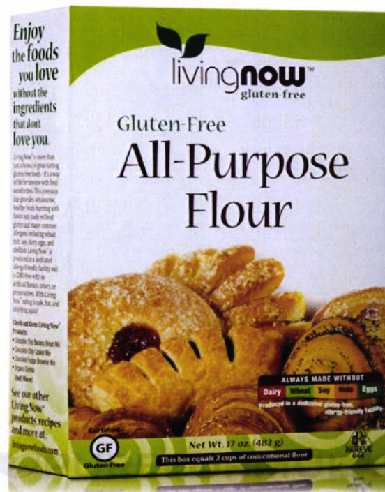
Figure 3. Unregistered LIVING NOW GLUTEN FREE Gluten-Free All-Purpose Flour (482 grams)