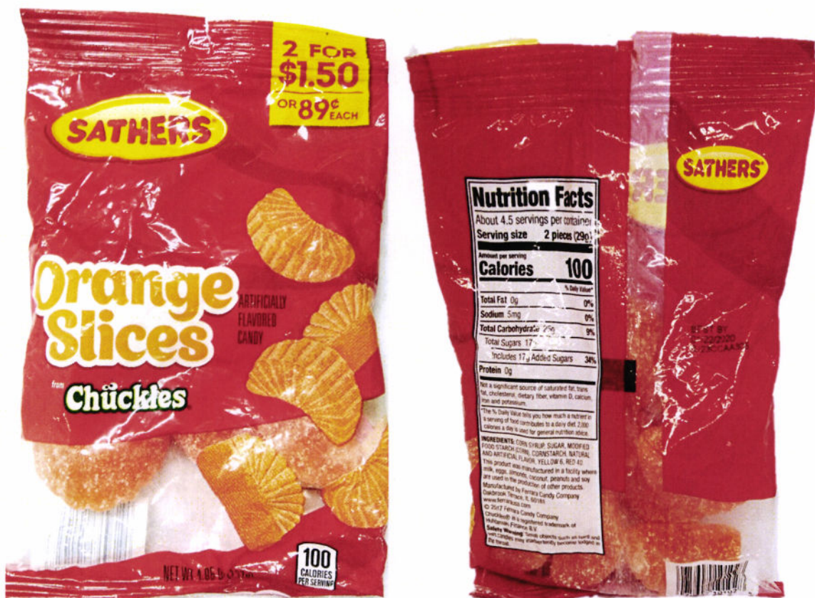
Figure 5. Unregistered SATHERS Orange Slices Artificially Flavored Candy (137 grams)