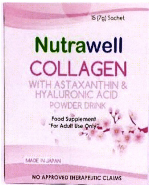
Figure 4. Unregistered NUTRAWELL Collagen with Astaxanthin & Hyaluronic Acid Food Supplement Powder (Drink Mix) 15 (7grams) Sachets