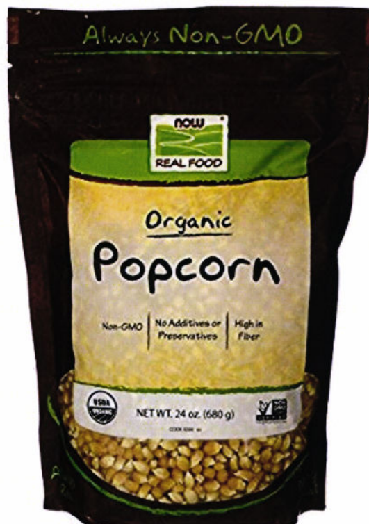
Figure 1. Unregistered NOW REAL FOOD Organic Popcorn (680 grams)

The Food and Drug Administration (FDA) warns the public from purchasing and consuming the following unregistered food products & food supplements: