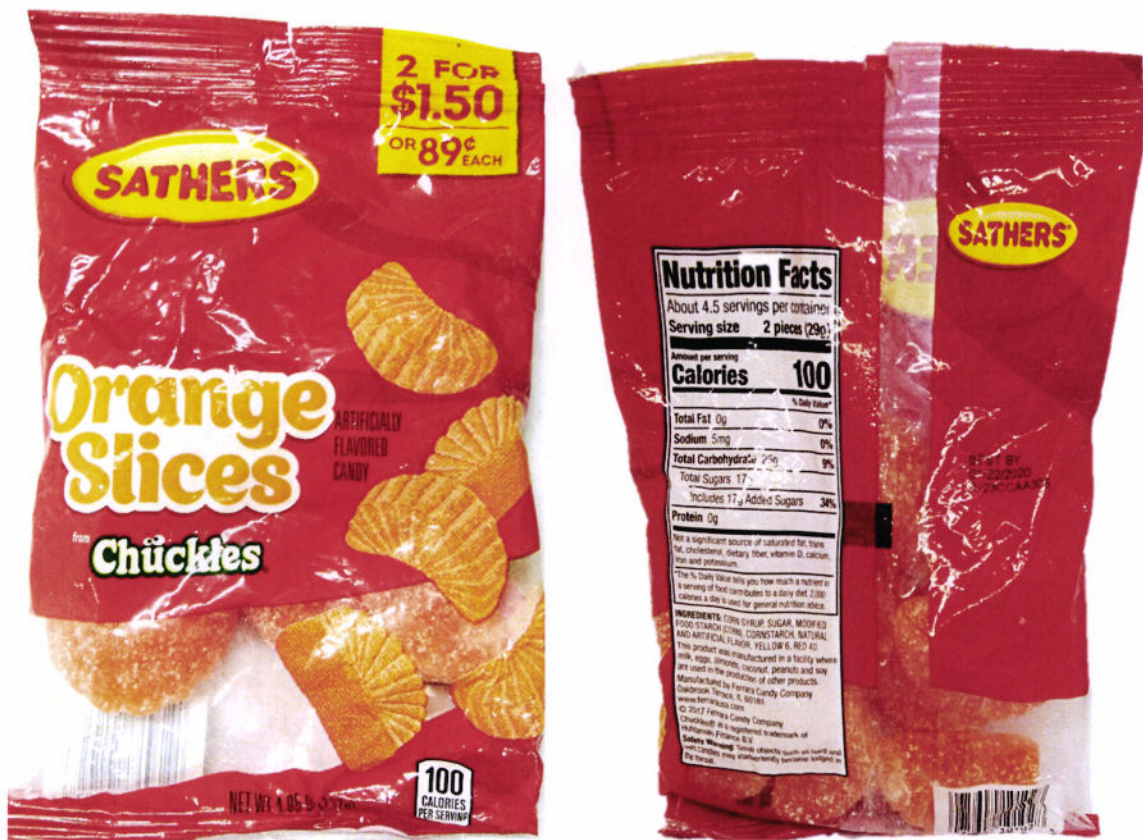
Figure 5. Unregistered SATHERS Orange Slices Artificially Flavored Candy (137 grams)