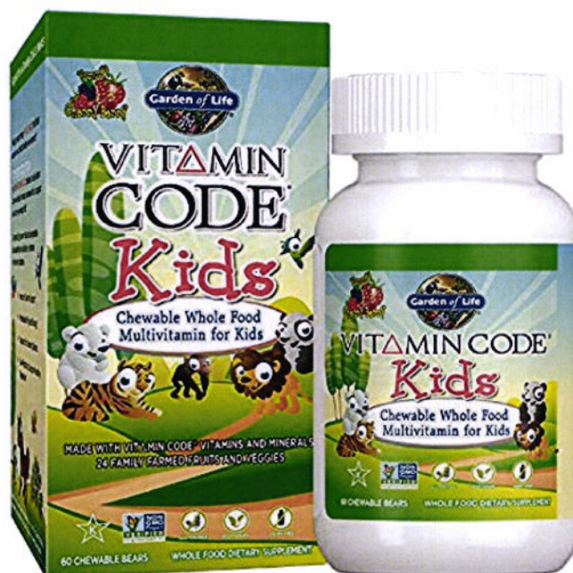
Figure 5. Unregistered GARDEN OF LIFE VITAMIN CODE Chewable Whole Food Multivitamin for Kids Dietary Supplement (60 chewable bears)