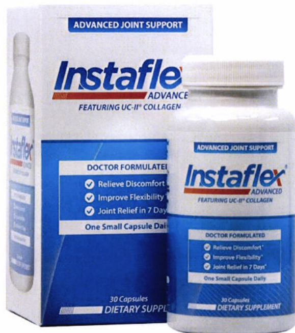
Figure 3. Unregistered ADVANCED JOINT SUPPORT INSTAFLEX ADVANCED Featuring UC-II® COLLAGEN Dietary Supplement