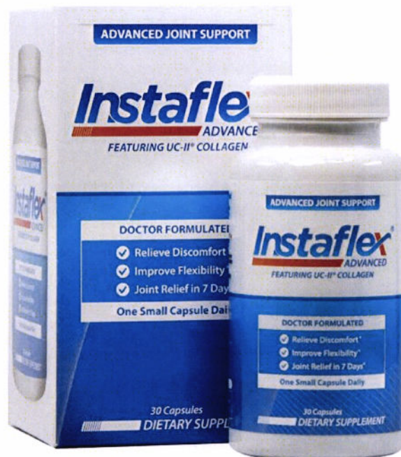
Figure 3. Unregistered ADVANCED JOINT SUPPORT INSTAFLEX ADVANCED Featuring UC-II® COLLAGEN Dietary Supplement