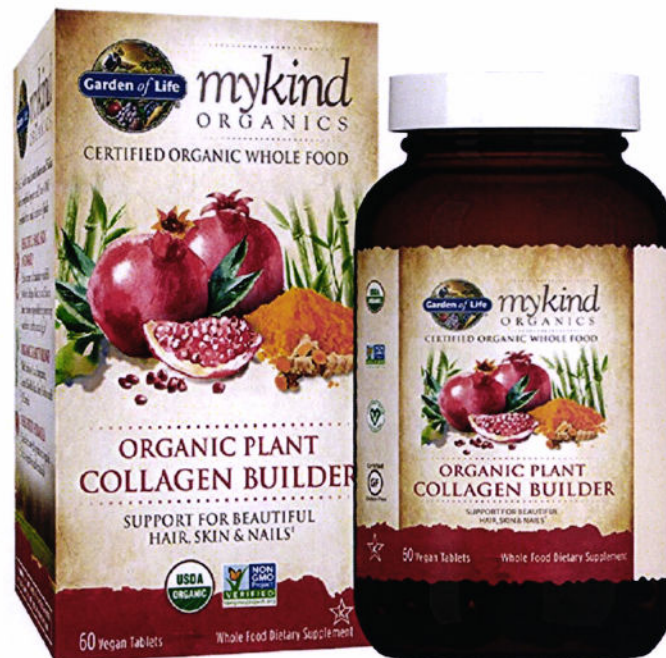
Figure 4. Unregistered GARDEN OF LIFE MYKIND ORGANICS Certified Organic Whole Food Organic Plant Collagen Builder Whole Food Dietary Supplement (60 tablets)