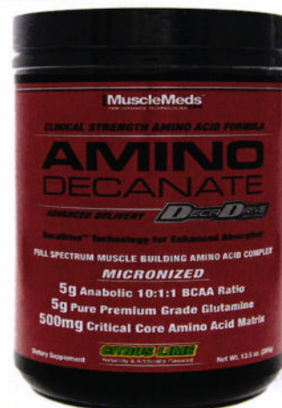
Figure 1. Unregistered MUSCLEMEDS® AMINO DECANATE Advance Delivery Deca Drive Full Spectrum Muscle Building Amino Acid Complex Micronized Citrus Lime Flavor Dietary Supplement (13.5 oz.)

The Food and Drug Administration (FDA) warns the public from purchasing and consuming the following unregistered food supplements: