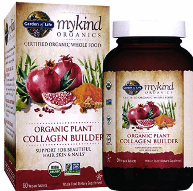
Figure 4. Unregistered GARDEN OF LIFE MYKIND ORGANICS Certified Organic Whole Food Organic Plant Collagen Builder Whole Food Dietary Supplement (60 tablets)