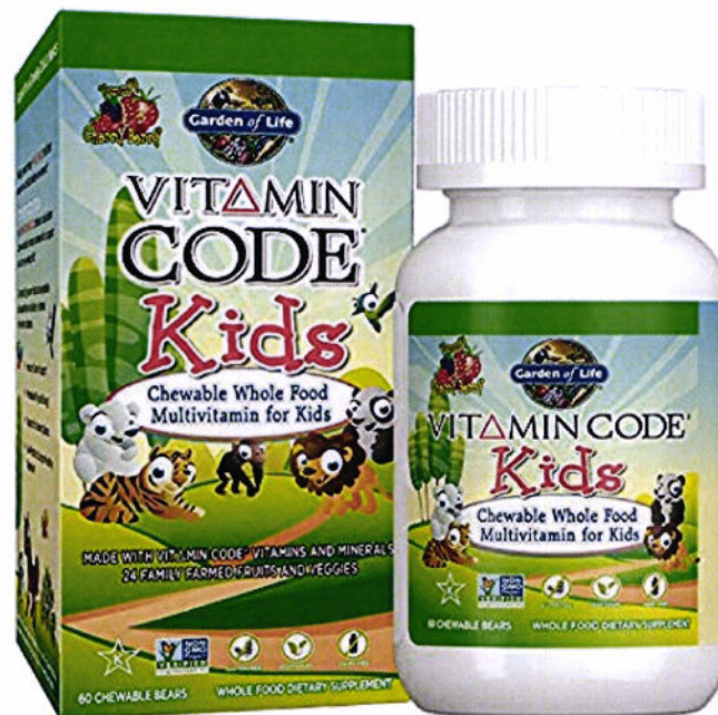
Figure 5. Unregistered GARDEN OF LIFE VITAMIN CODE Chewable Whole Food Multivitamin for Kids Dietary Supplement (60 chewable bears)