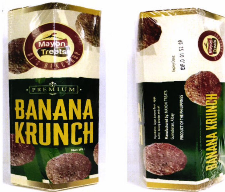
Figure 4. Unregistered MAYON TREATS Premium Banana Krunch