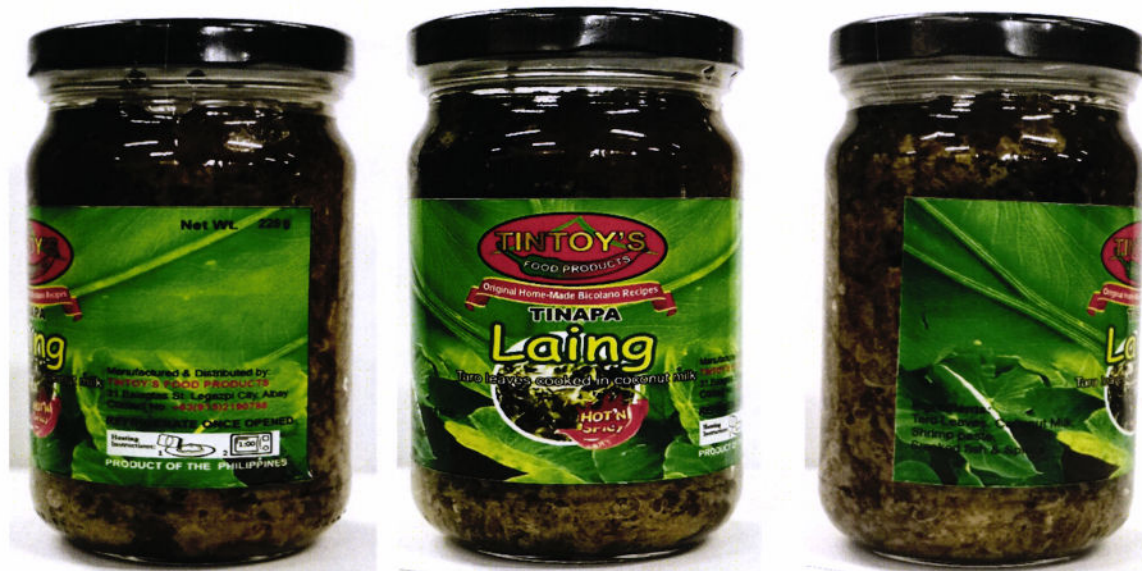
Figure 1. Unregistered TINTOY'S FOOD PRODUCTS Original Home-Made Bicolano Recipes Tinapa Laing

The Food and Drug Administration (FDA) advises the public from purchasing and consuming the following unregistered food products: