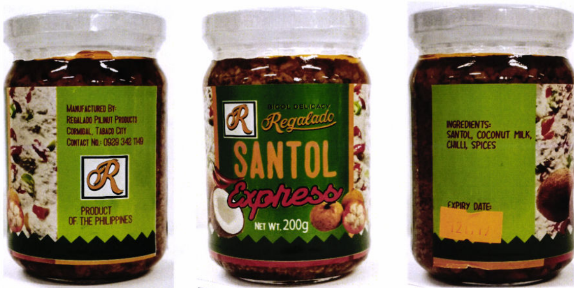
Figure 2. Unregistered REGALADO BICOL DELICACY Santol Express