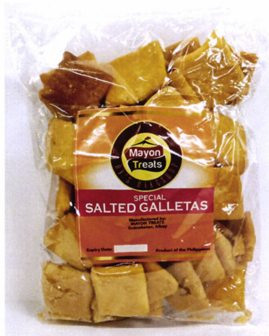
Figure 3. Unregistered MAYON TREATS Special Salted Galletas