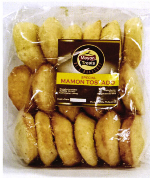
Figure 5. Unregistered MAYON TREATS Special Mamon Tostado

The FDA verified through post-marketing surveillance that the abovementioned food products are not authorized and the Certificates of Product Registration (CPR) have not been issued. Pursuant to the Republic Act No. 9711, otherwise known as the “Food and Drug Administration Act of 2009”, the manufacture, importation, exportation, sale, offering for sale, distribution, transfer, non-consumer use, promotion, advertising or sponsorship of health products without the proper authorization is prohibited.